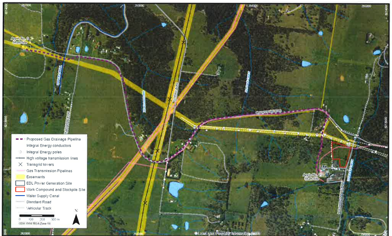
Appin East Mine Safety Gas Management Project

19. After APPENDIX 5, insert the following: