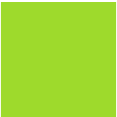
P1a Feature Colour 1