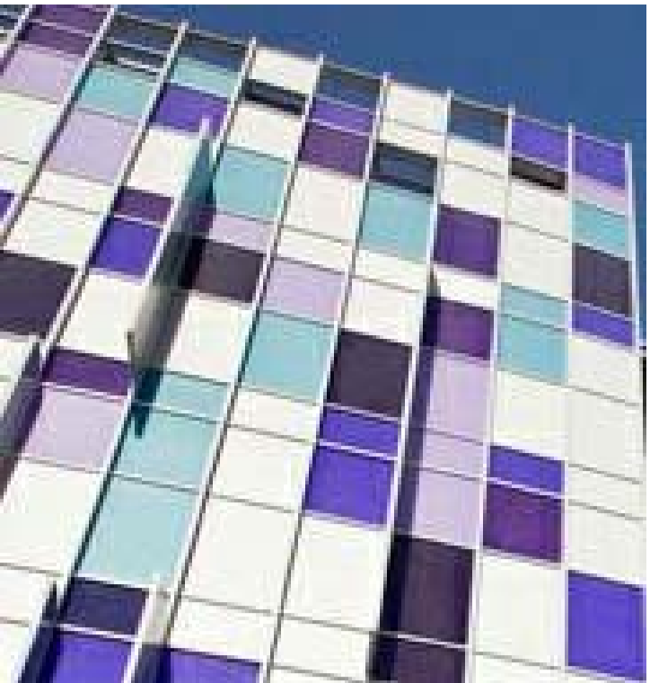
Prefinished Aluminium Framed Feature Screen