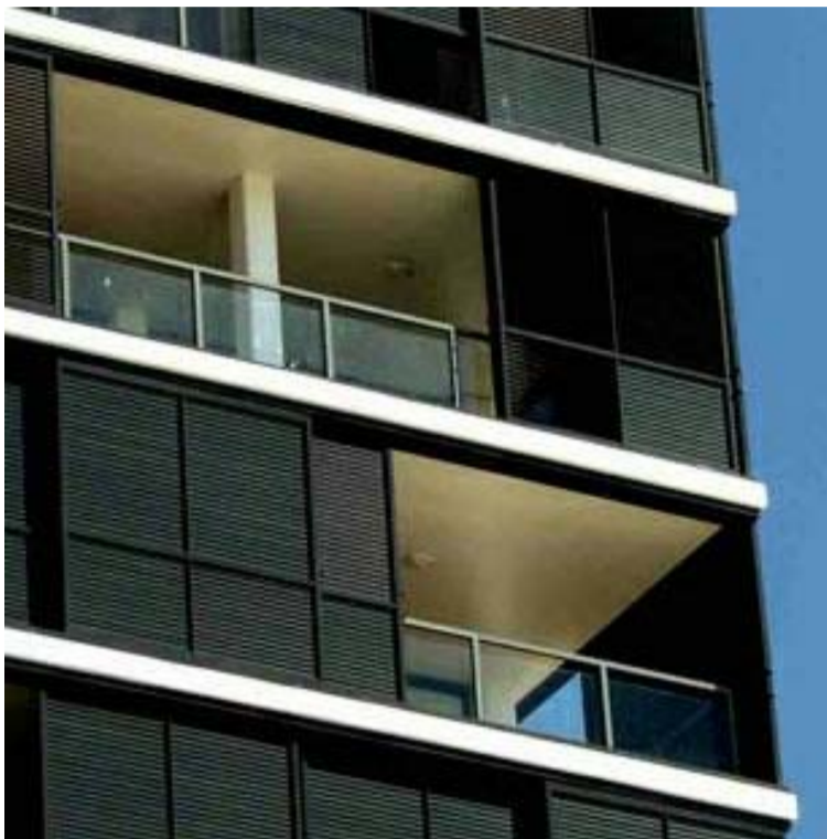
Prefinished Metal Framed Sun Screen Panels To Residential Levels