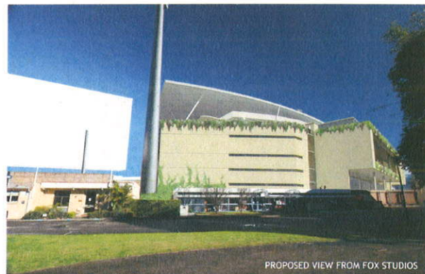
Figure 10: Proposed view of rear of new Stand