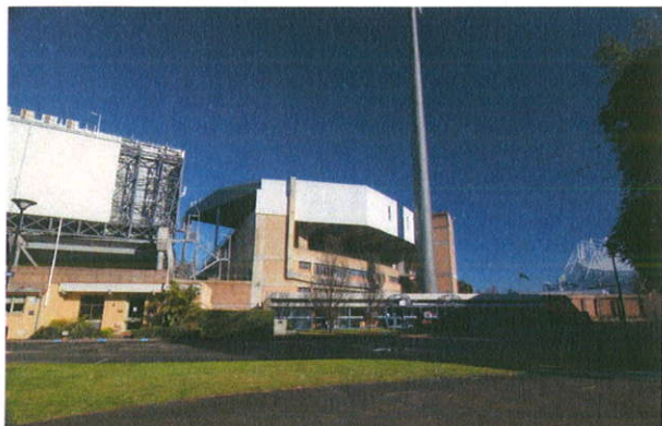
Figure 9: Existing view of rear of the Stands