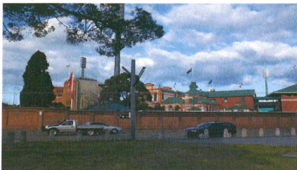
Figure 7: Existing view from Driver Ave over Members Stand