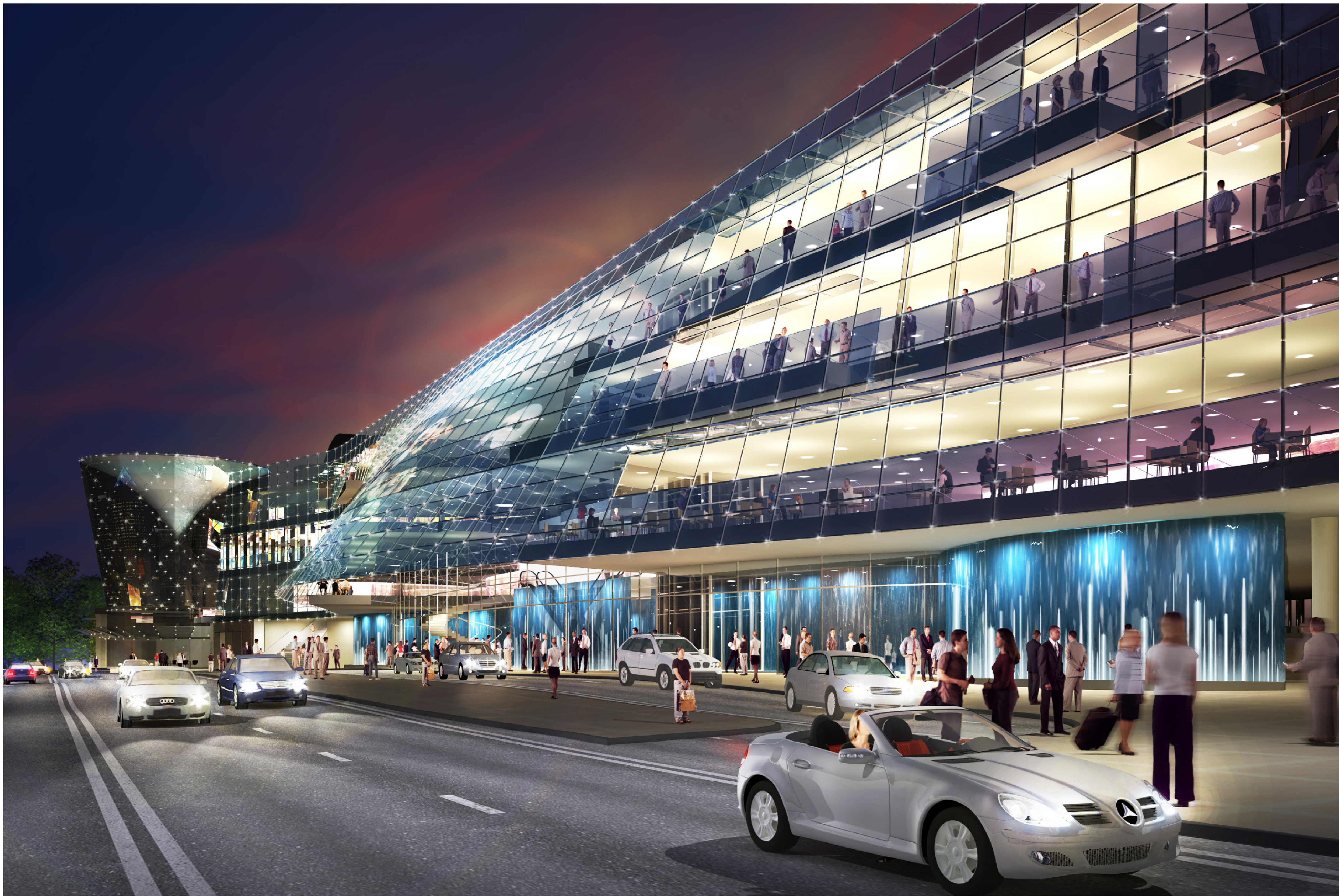
VIEW OF NEW ENTRY ALONG PIRRAMA RD - EVENING