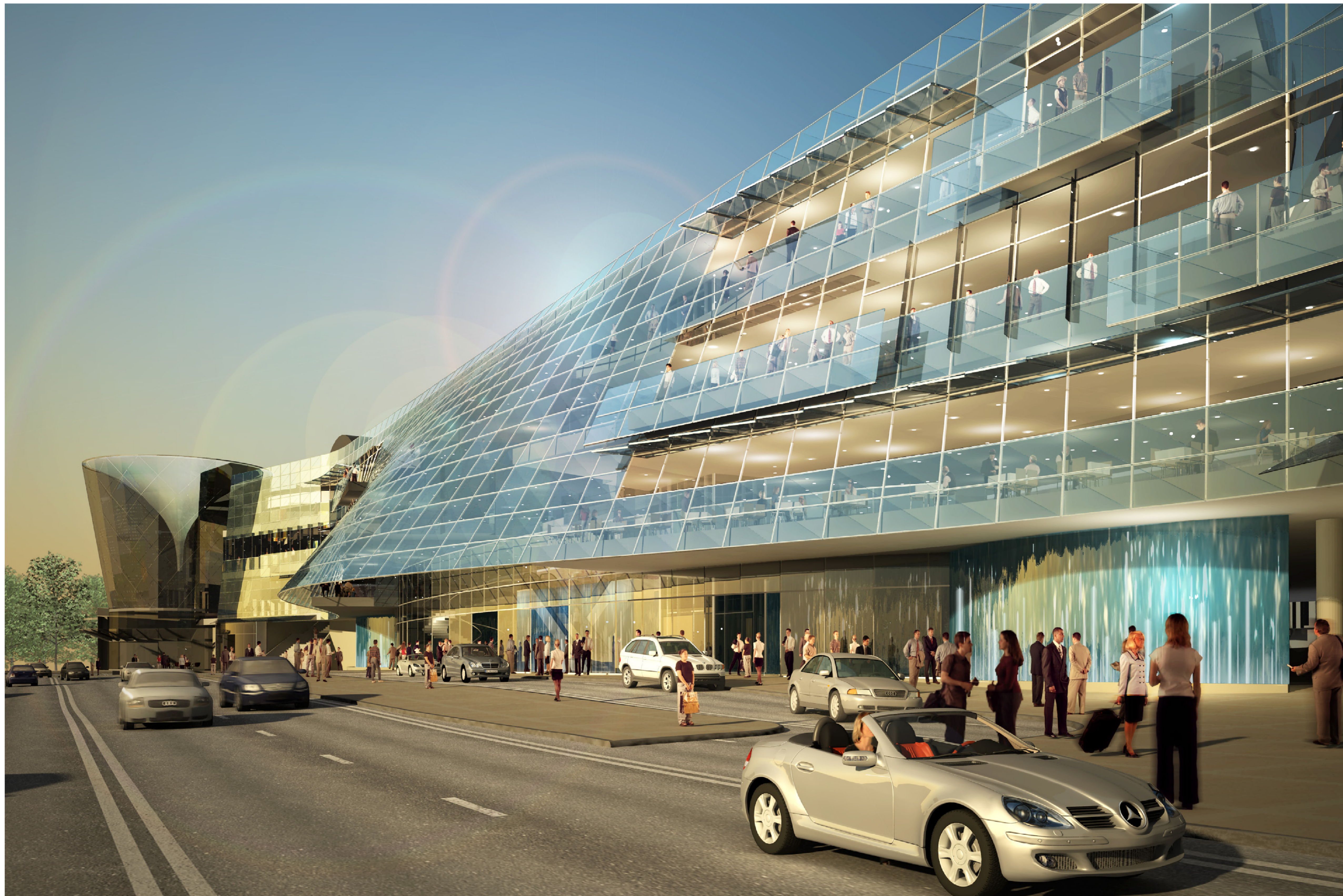
VIEW OF NEW ENTRY ALONG PIRRAMA RD - DAYTIME