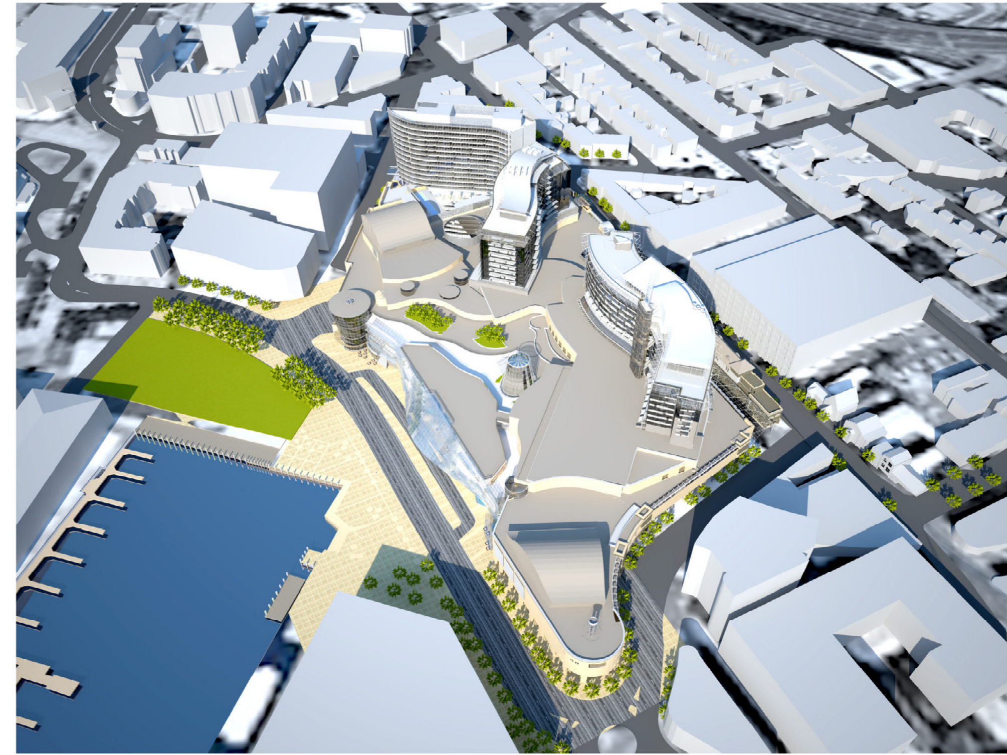
NORTH AXONOMETRIC VIEW