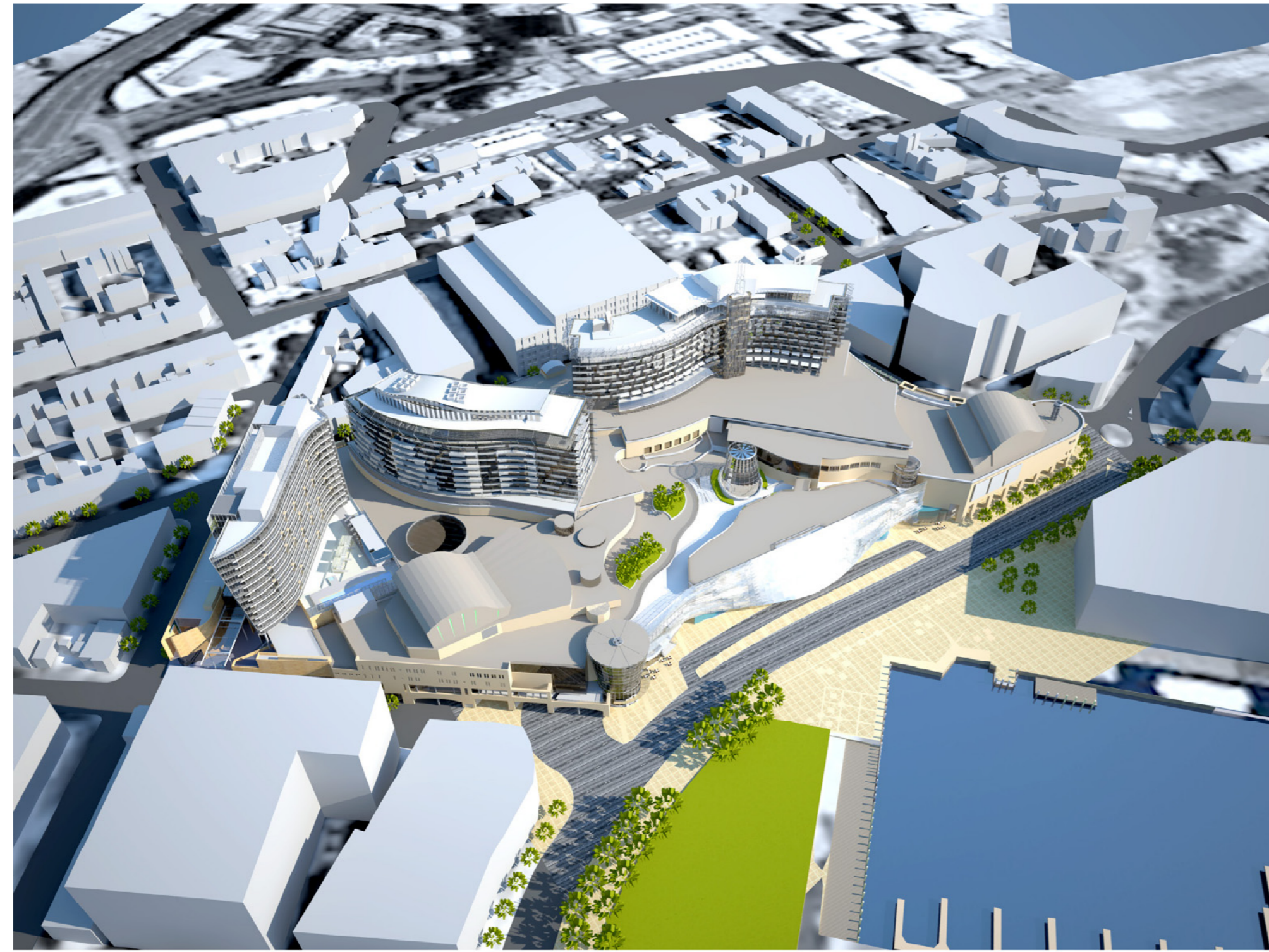
EAST AXONOMETRIC VIEW