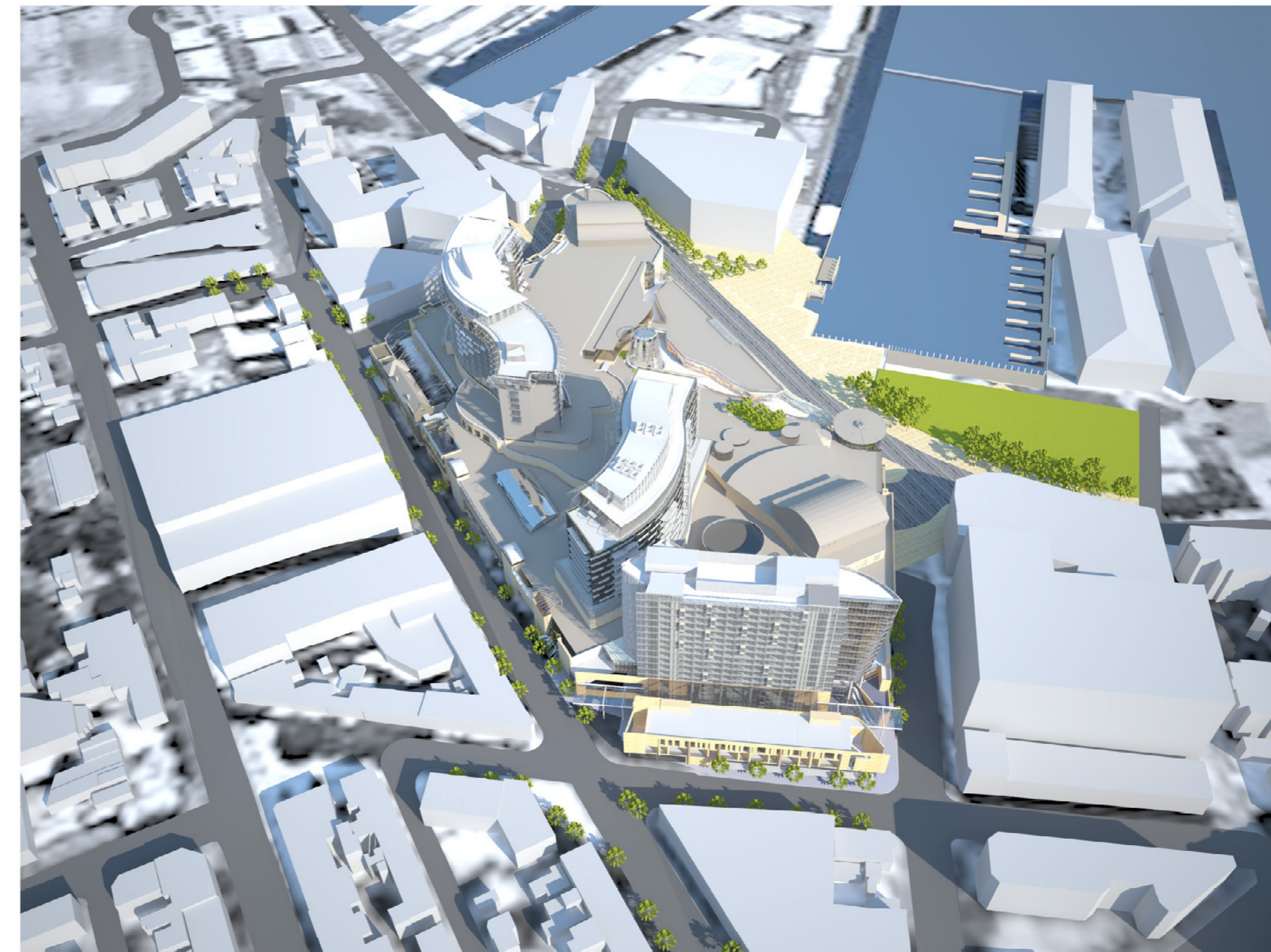
SOUTH AXONOMETRIC VIEW