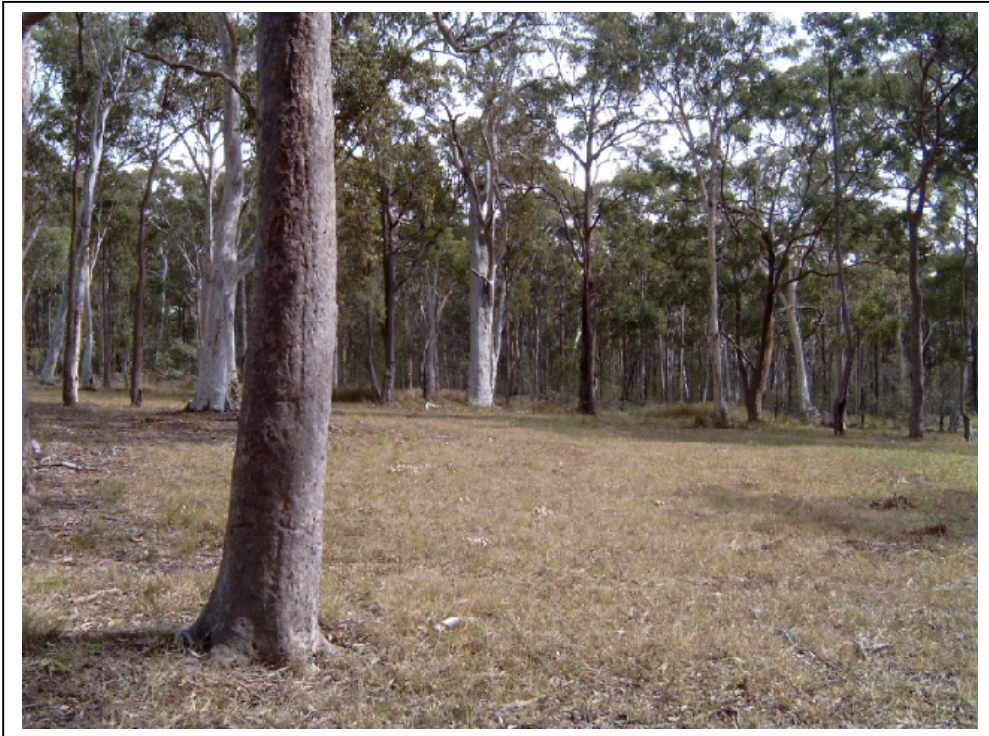
Photograph 2 View east across mid slope area