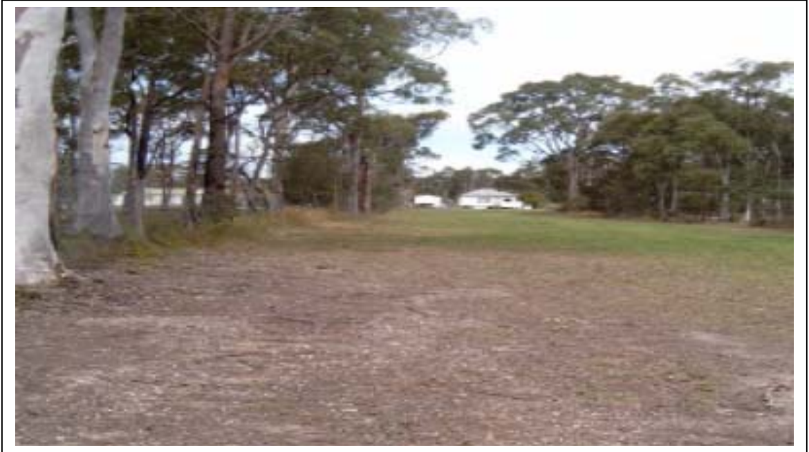
Photo 6 Example of the eastern side of the exposure area

Photograph 5 View north with part of the exposure inspected by area transects 1 &2. The exposure extends to the east for approximately 50m.