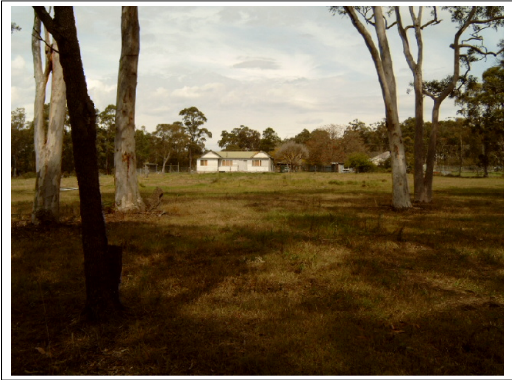
Photograph 4 View north from mid slope