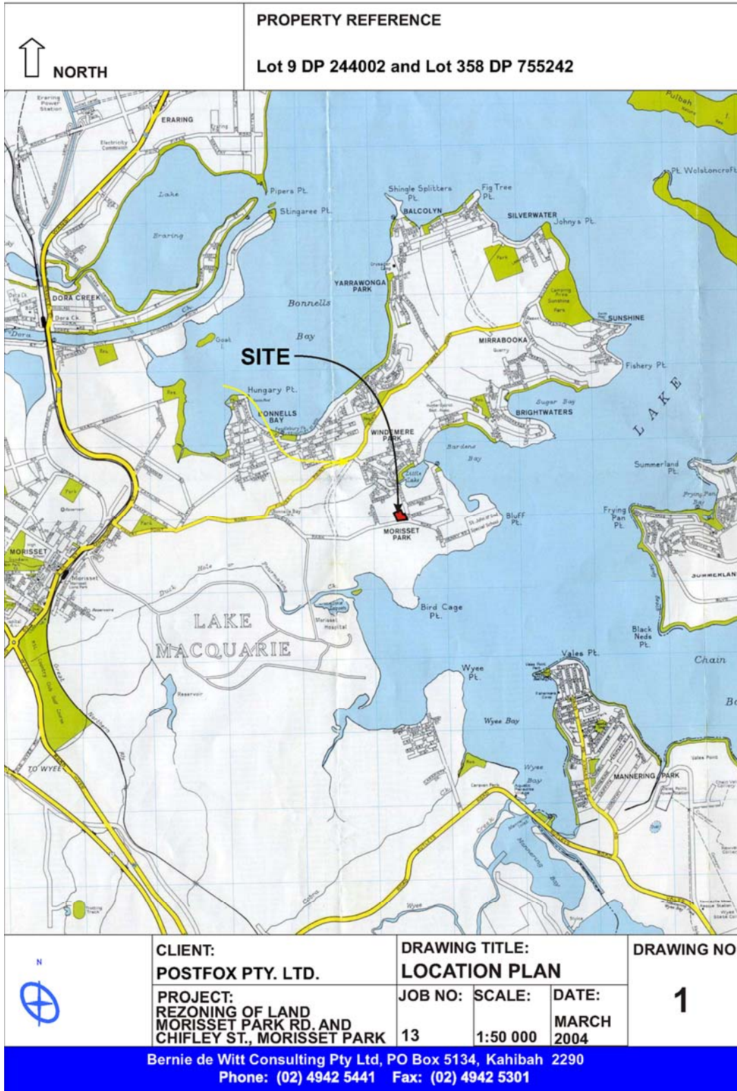
Figure 1 - Study Area Location