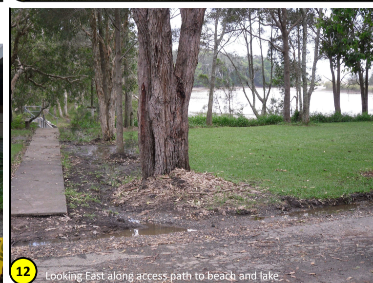
12 Looking East along access path to beach and lake