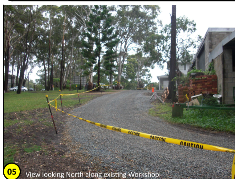
05 View looking North along existing Workshop