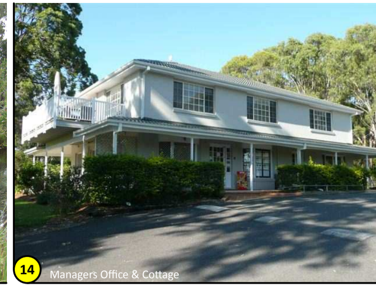
14 Managers Office & Cottage