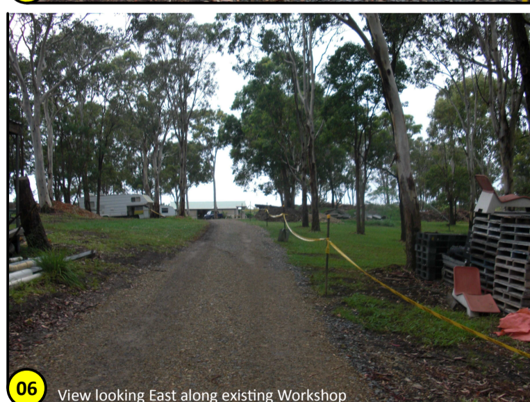
06 View looking East along existing Workshop