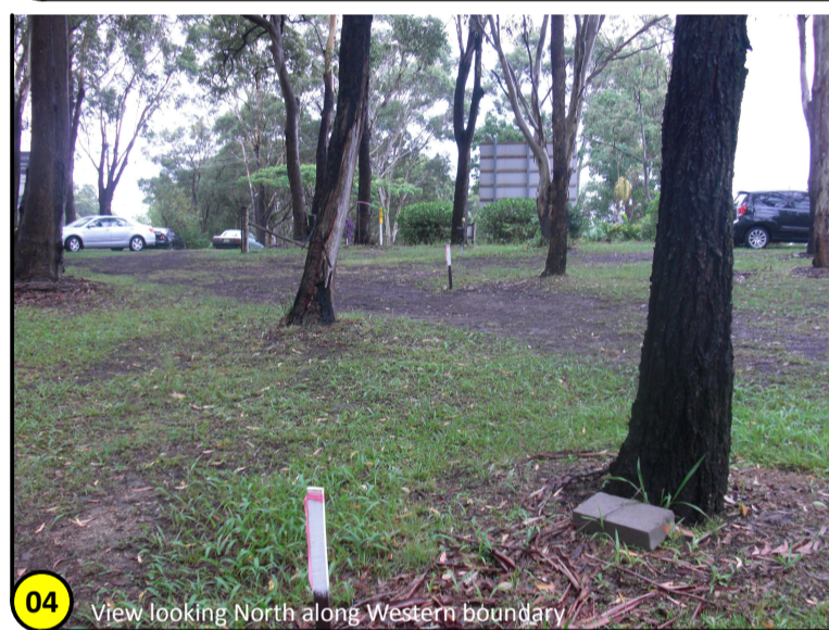
04 View looking North along Western boundary