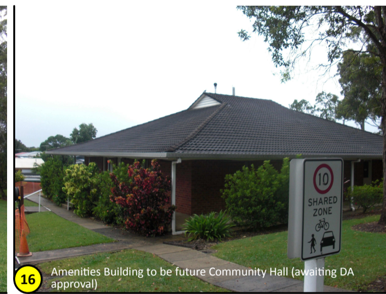
16 Amenities Building to be future Community Hall (awaiting DA approval)