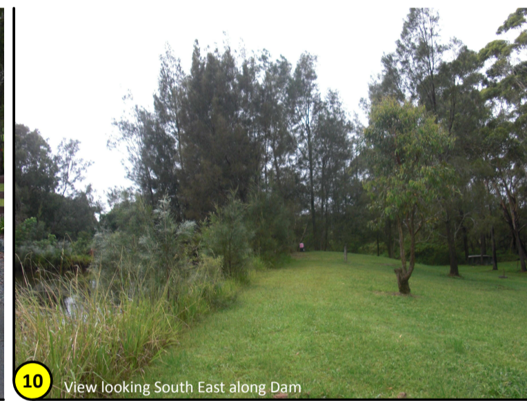
10 View looking South East along Dam