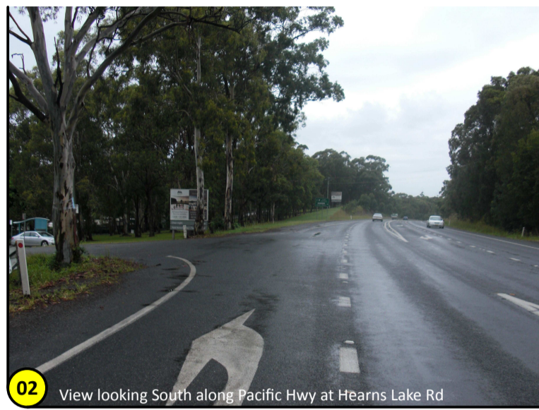
02 View looking South along Pacific Hwy at Hearn's Lake Rd