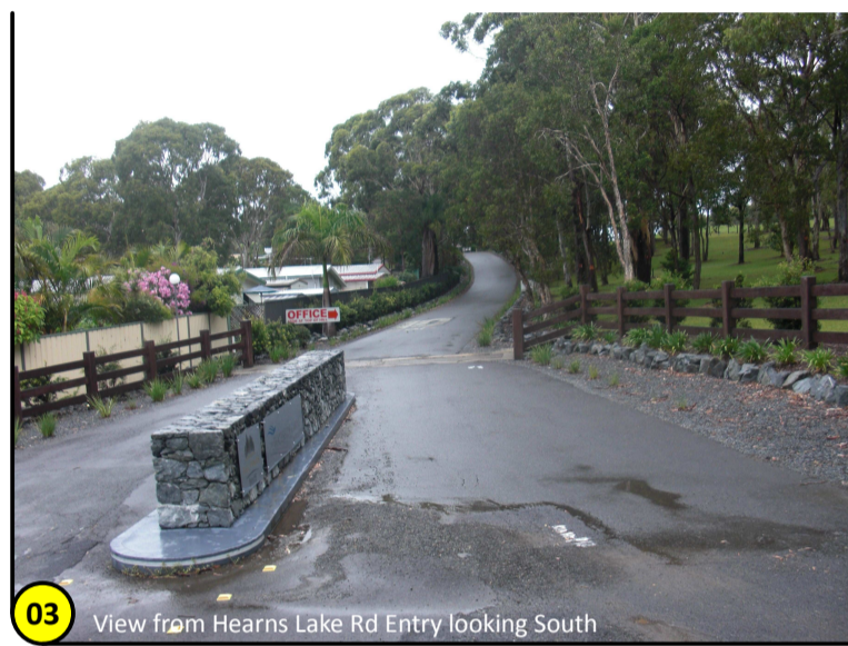
03 View from Hearn's Lake Rd Entry looking South