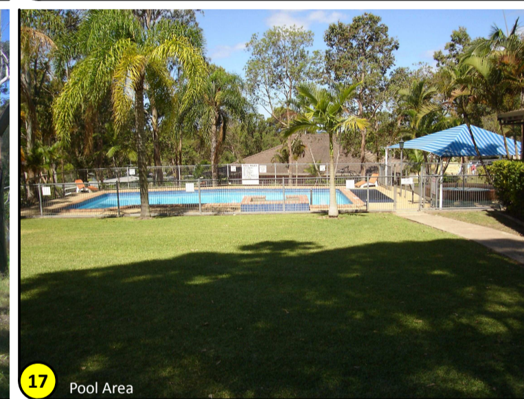
17 Pool Area