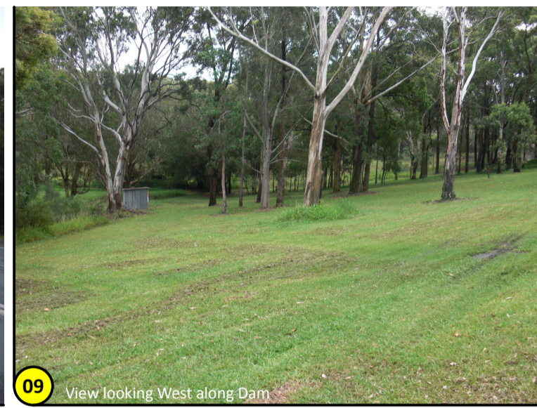
09 View looking West along Dam