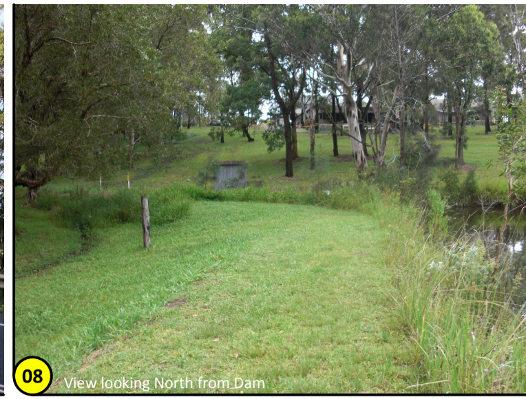
08 View looking North from Dam