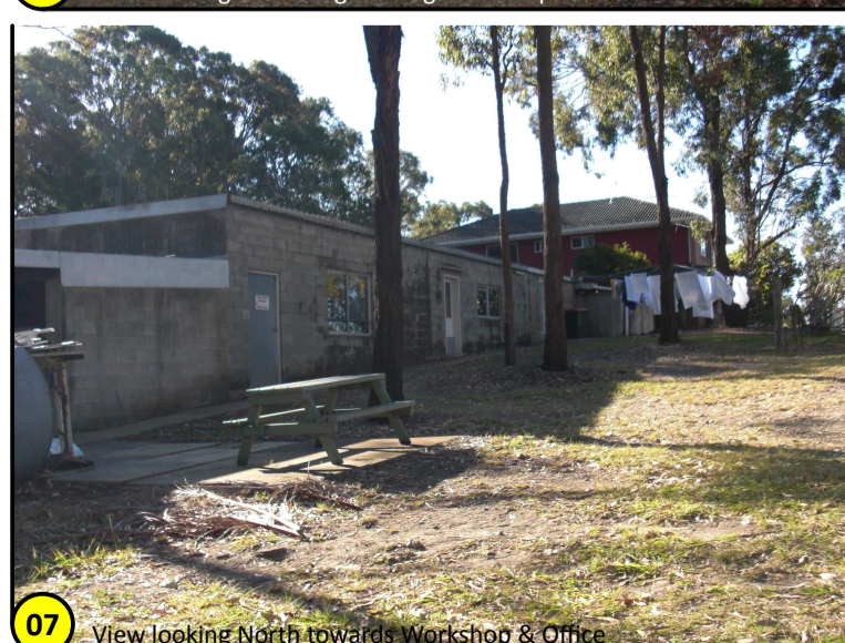
07 View looking North towards Workshop & Office