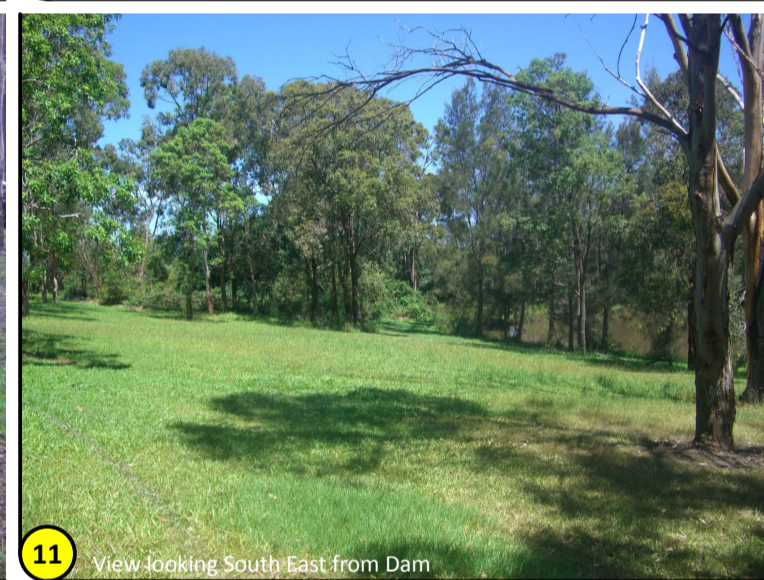
11 View looking South East from Dam