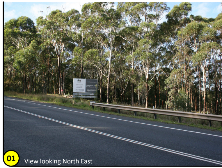
01 View looking North East