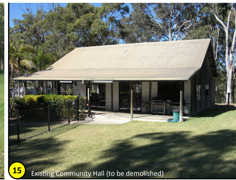
15 Existing Community Hall (to be demolished)