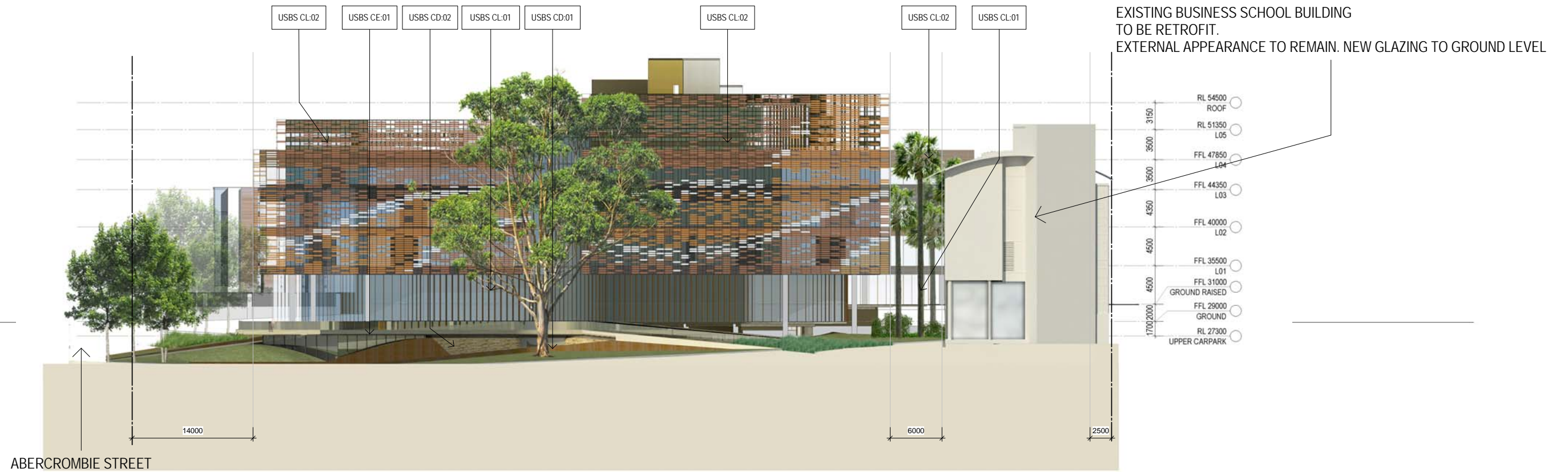
1 RENDERED ELEVATION - EAST (CODRINGTON STREET) SCALE 1 : 250