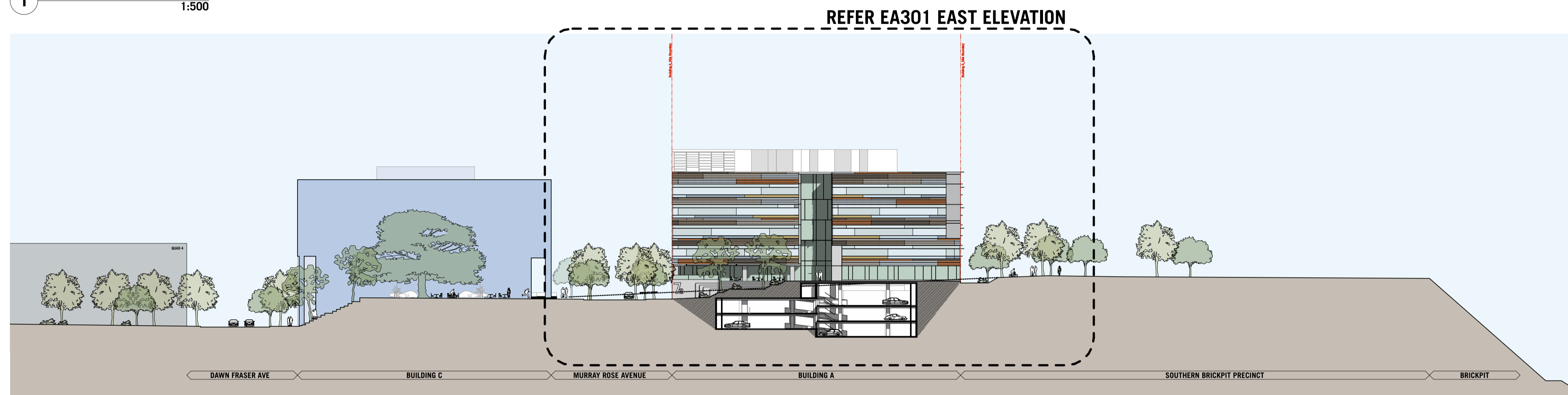
2 EAST ELEVATION_MASTER PLAN 1:500