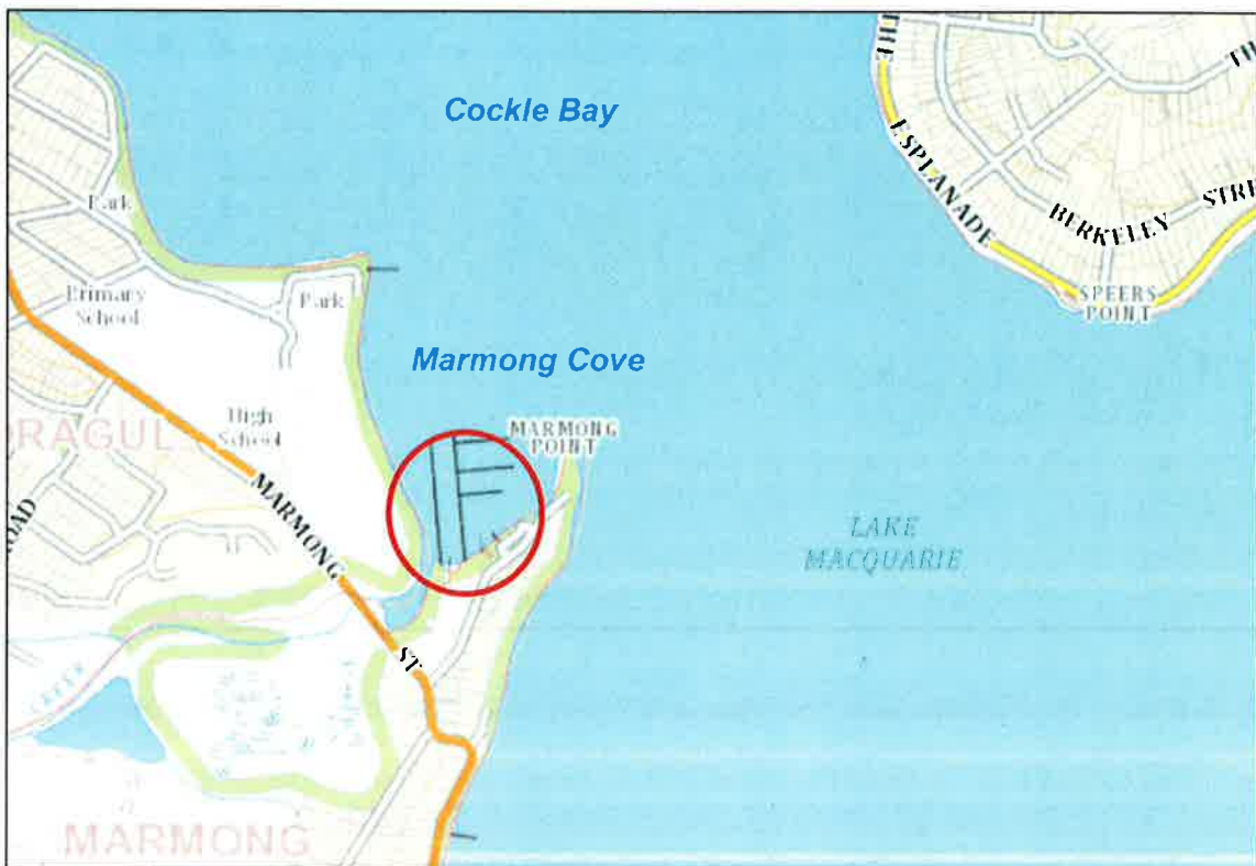
Figure 1 – Location of the subject site

The site is located in Marmong Cove on the southern shore of Cockle Bay at the northern end of Lake Macquarie. The site contains the Marmong Point Marina at 1-13 Nanda St, Marmong Point (refer to Figure 1 ). The marina covers an area of 1.73 hectares, including the water based component.