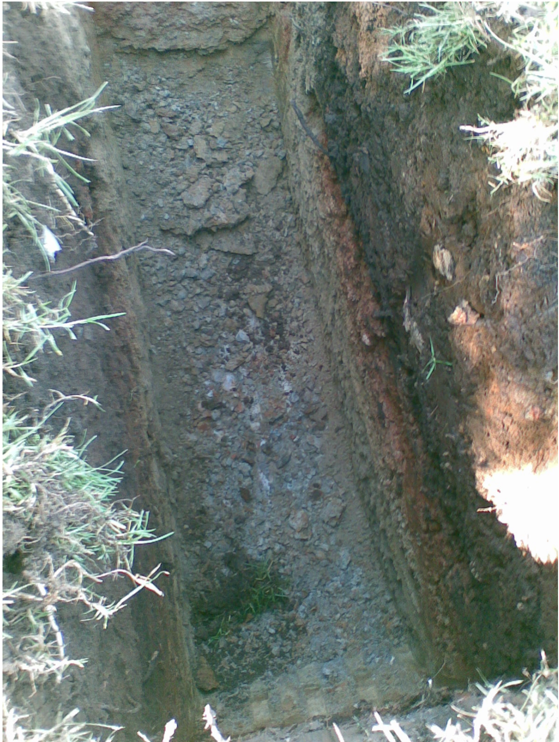
Photograph 5: View of typical soil profile at most locations.