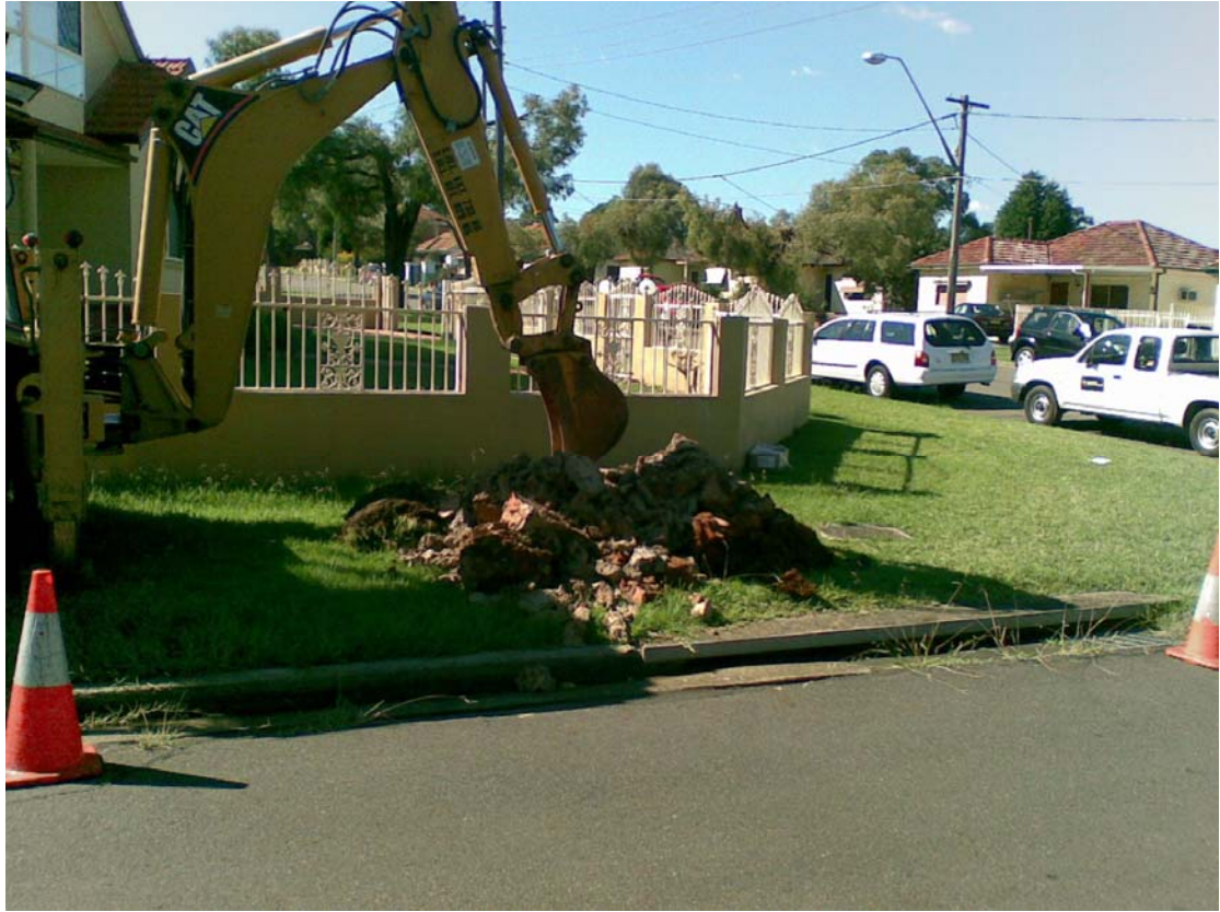
Photograph 6: View of excavator on roadside, Barbers Street