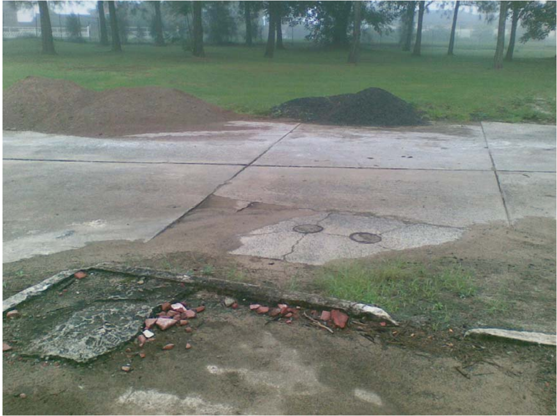
Photograph 3: View looking west over Woodville Reservoir footprint.