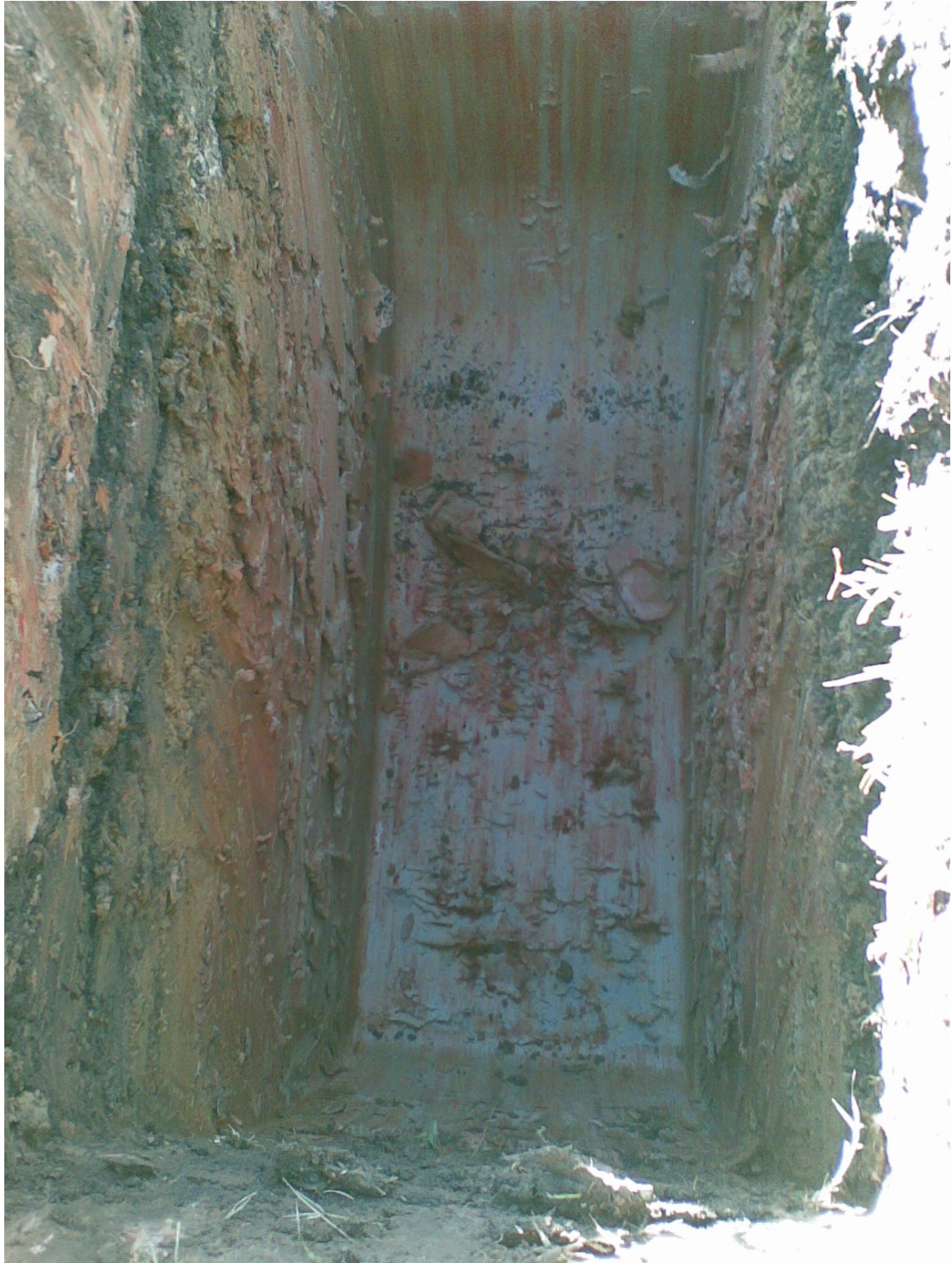
Photograph 9: View of excavation showing typical red to grey mottled clay layer encountered where ASS soils are present.