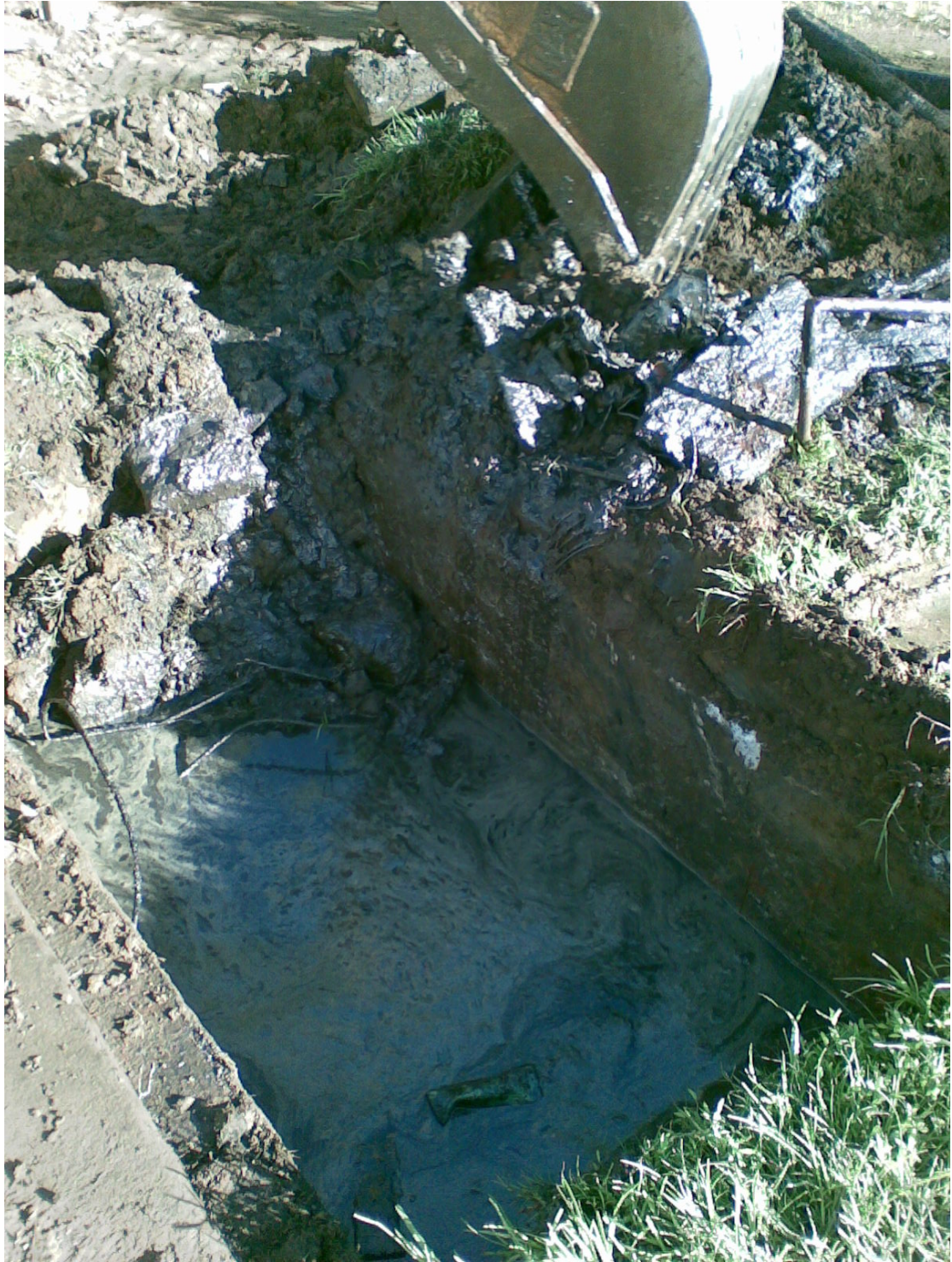
Photograph 4: View of excavation next to Woodville reservoir footprint, uncovering building material and water.