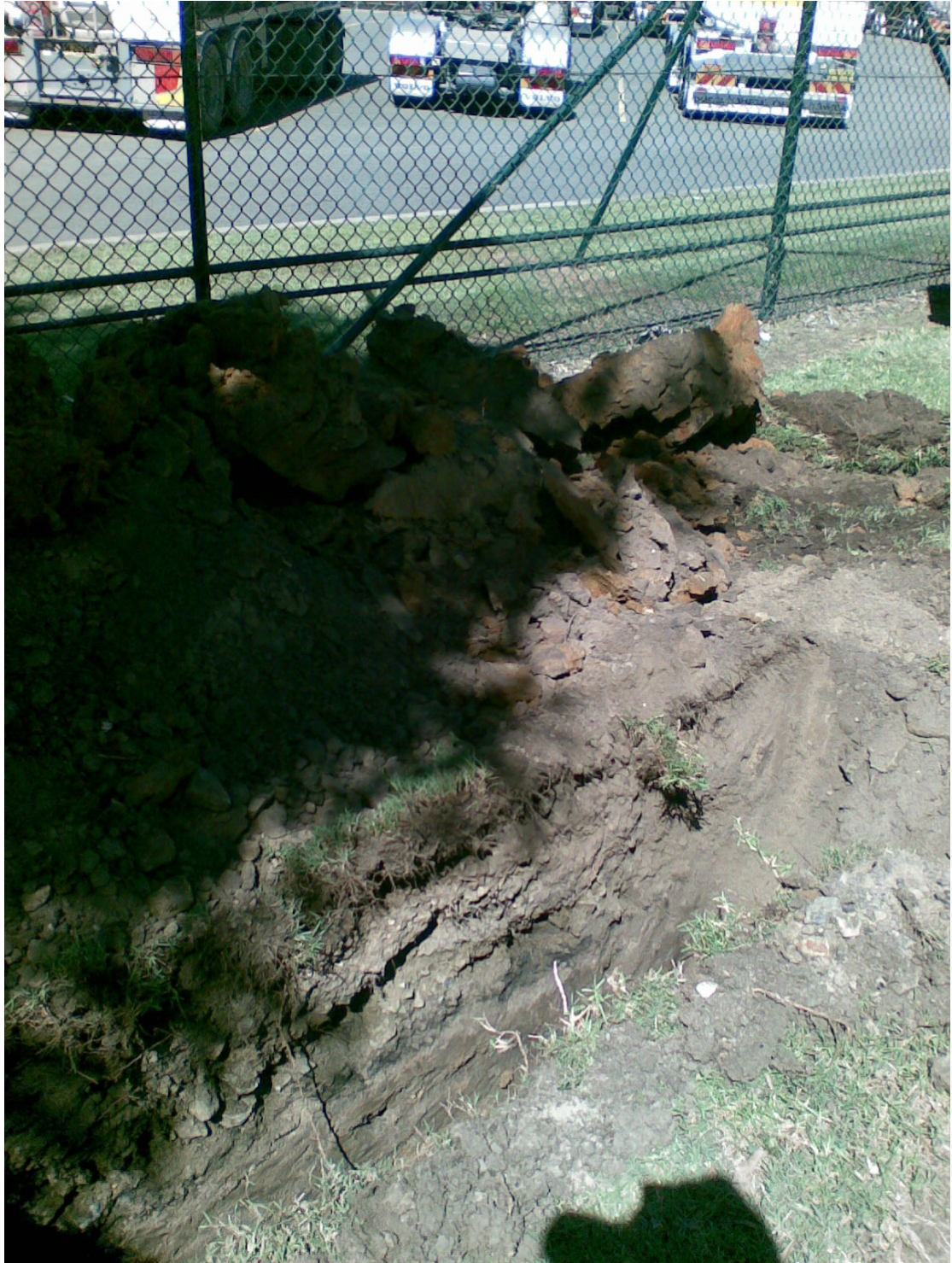
Photograph 8: View of excavation in Durham Street showing small layer of ash present