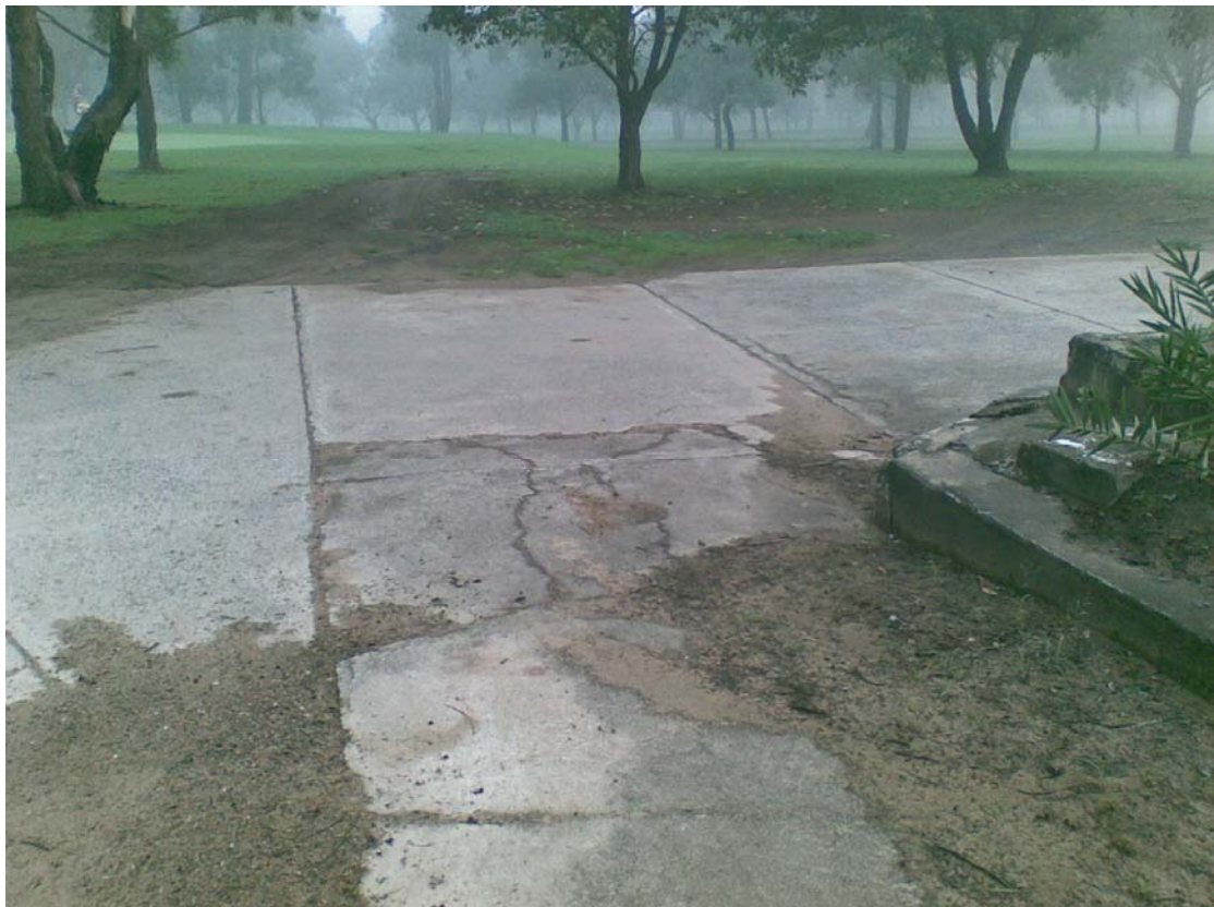
Photograph 2: View of north east corner of Woodville Reservoir footprint.