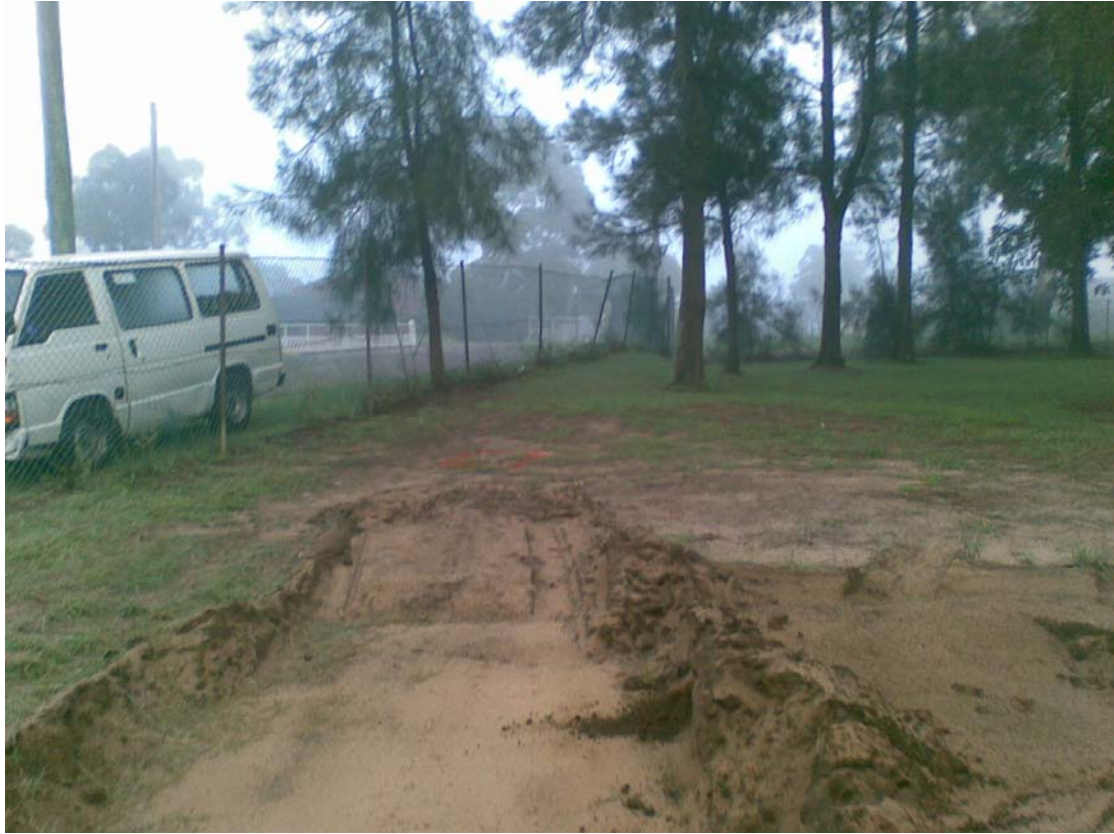
Photograph 1: View of south east corner of Woodville Reservoir footprint.