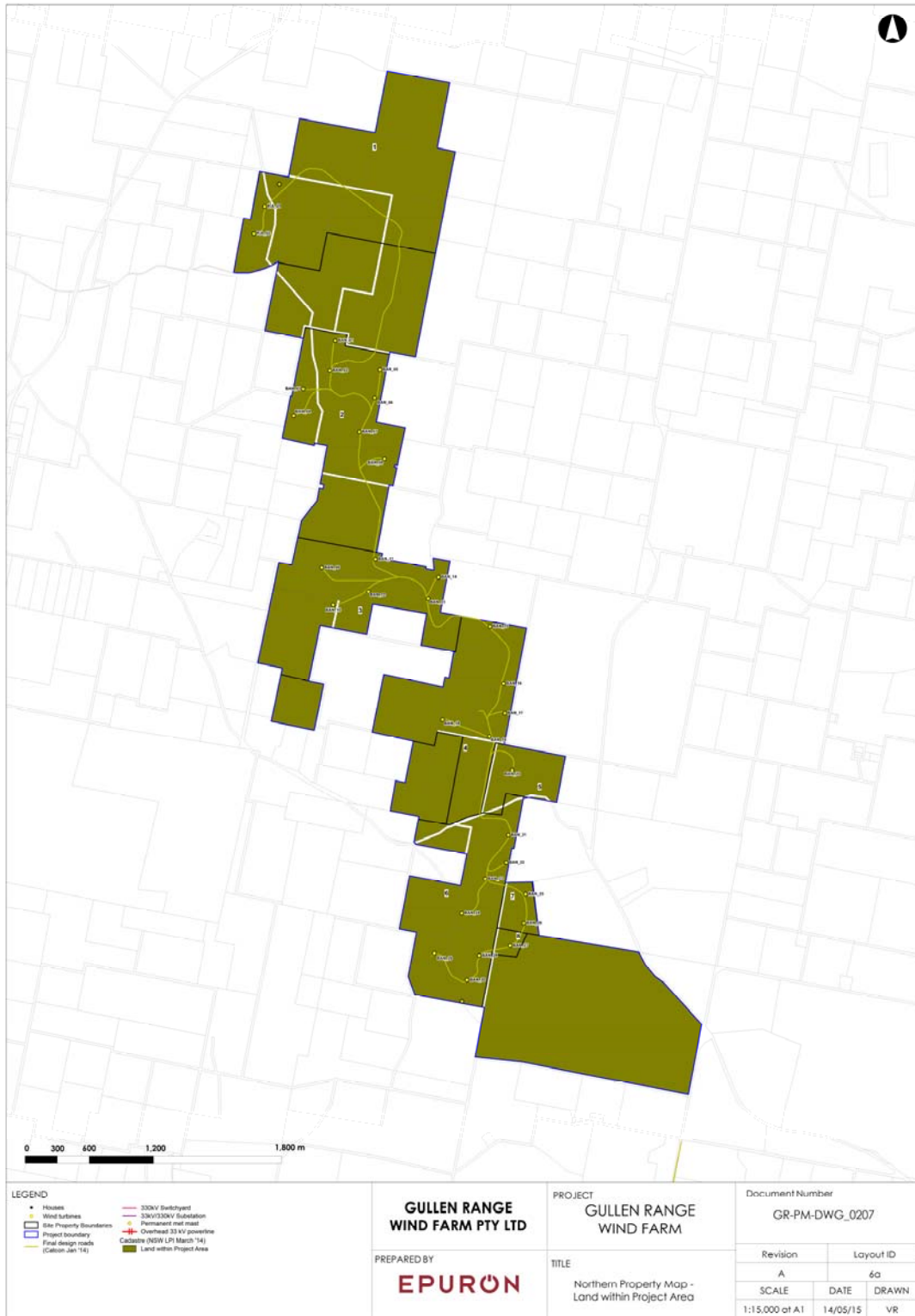
Figure A1-1 Project Layout – Northern Turbines