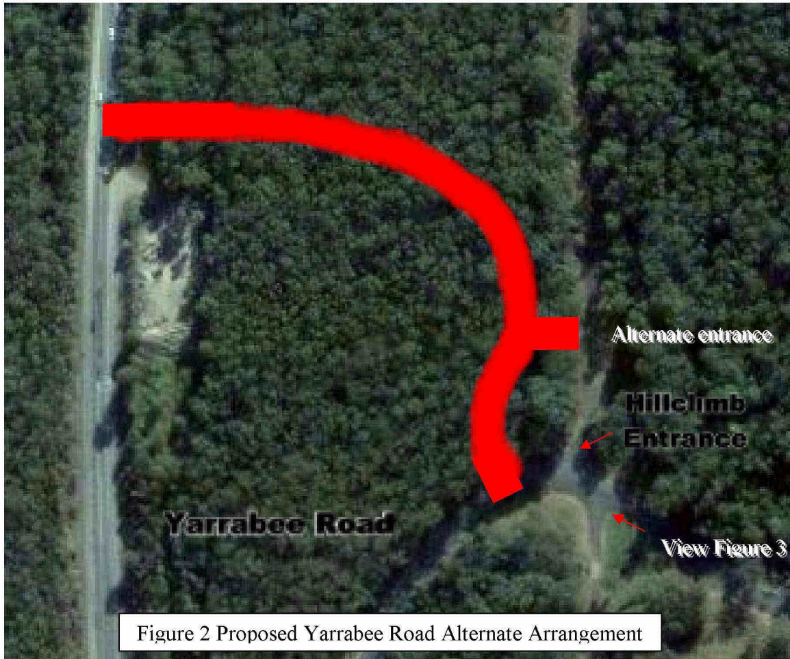
Figure 2 Proposed Yarrabee Road Alternate Arrangement