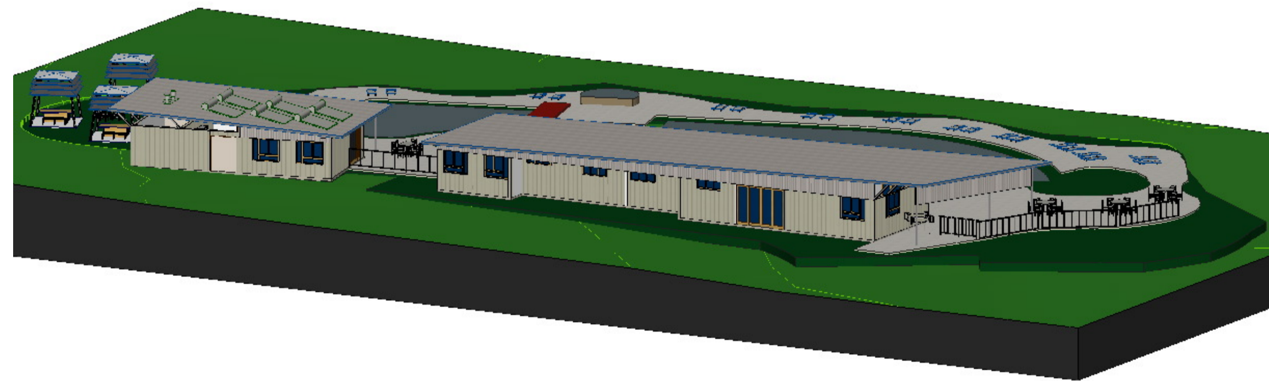
2 Axonometry 02 1:1250