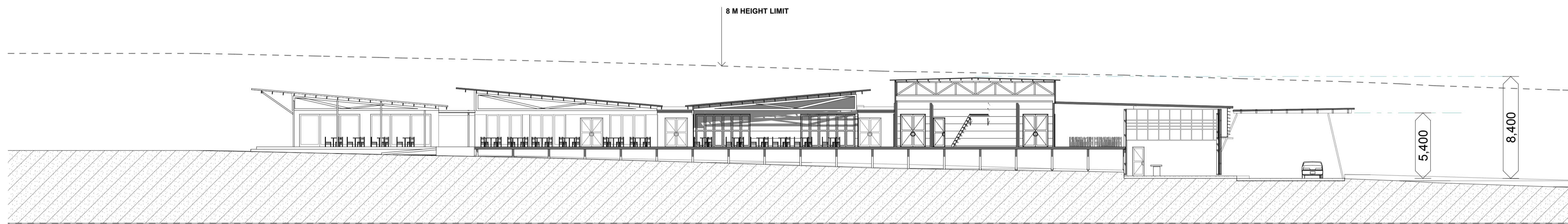
4 AA2 SECTION 1:200