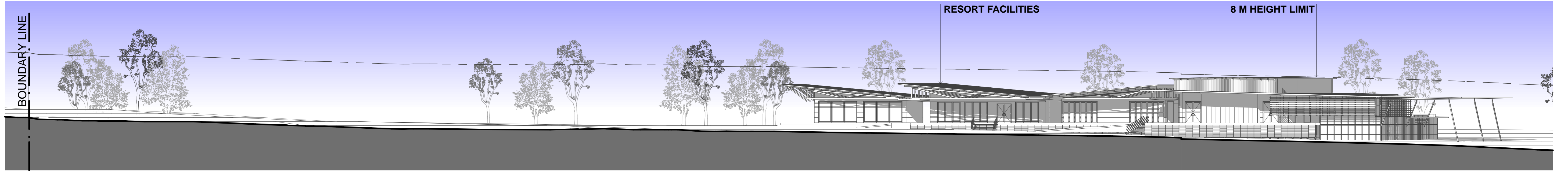
E1 NORTH PART A Scale 1:250