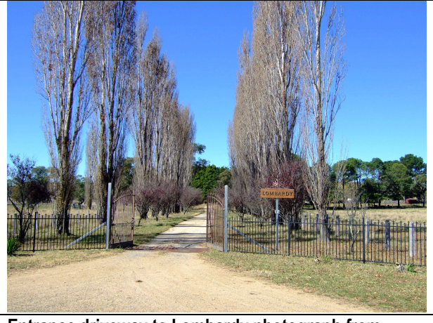
Entrance driveway to Lombardy photograph from Cherry Tree Road