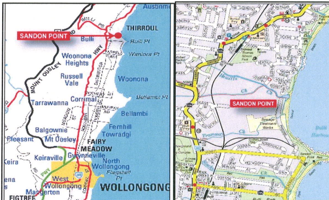
Figure 1: Location maps

The site is located within the Wollongong LGA and is approximately 14 kilometres north of the Wollongong CBD. Sandon Point is bound by Thomas Gibson Park and private landholdings to the north; McCauley's Beach to the east; the Point Estate (a subdivision development by Stockland) to the south; and the Illawarra railway line to the west. Sandon Point is south of the Thirroul village centre and Thirroul railway station. The site locality and site boundary are illustrated in Figures 1 and 2 .