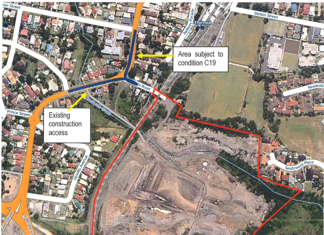
Figure 3: Area subject of Modification (site boundary shown in red)

The site boundary and the length of the Lawrence Hargrave Drive to which this modification relates are illustrated in Figure 3 below: