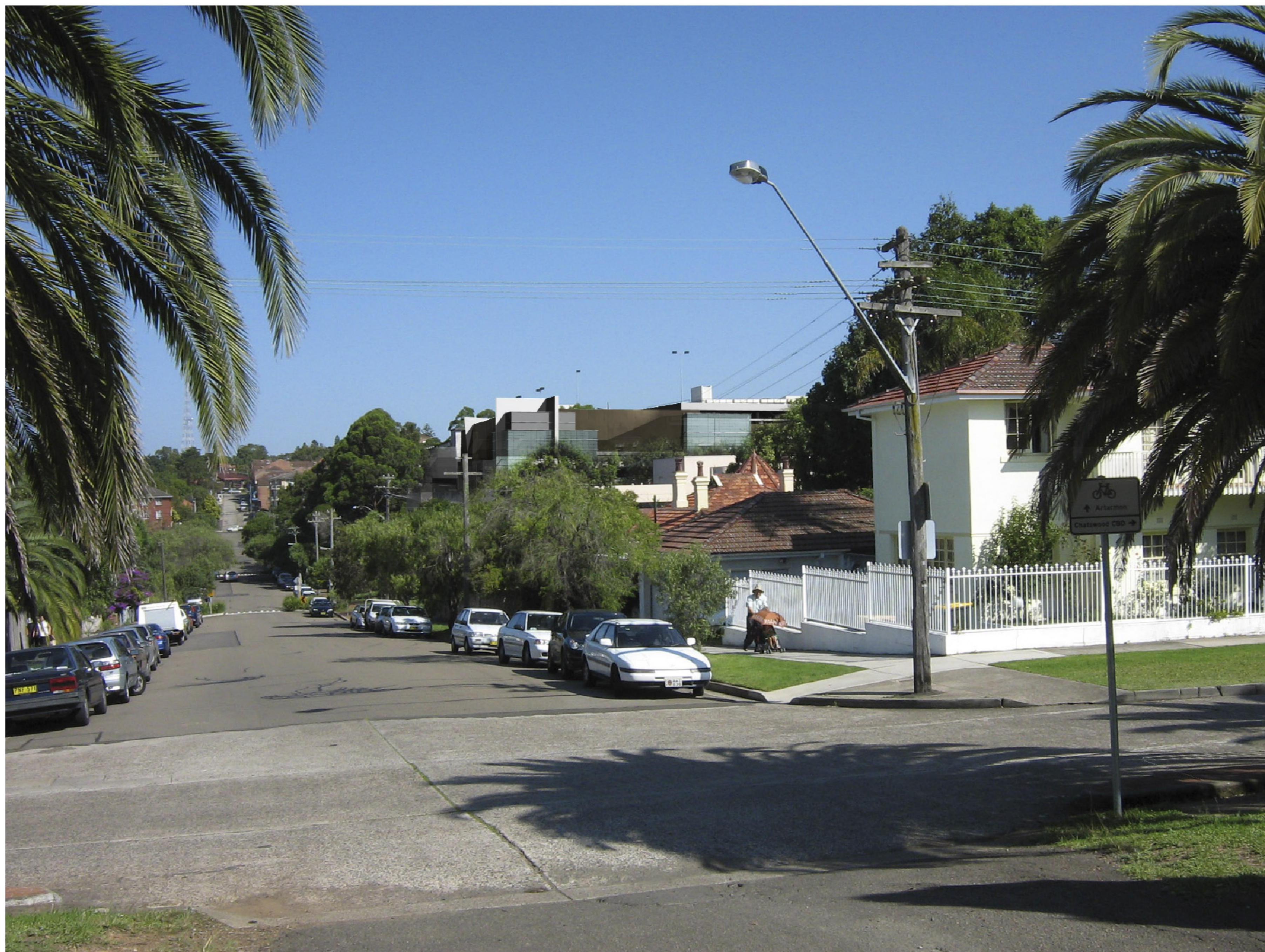
PROPOSED STREETScape - NORTHERN END HAVILAH STREET