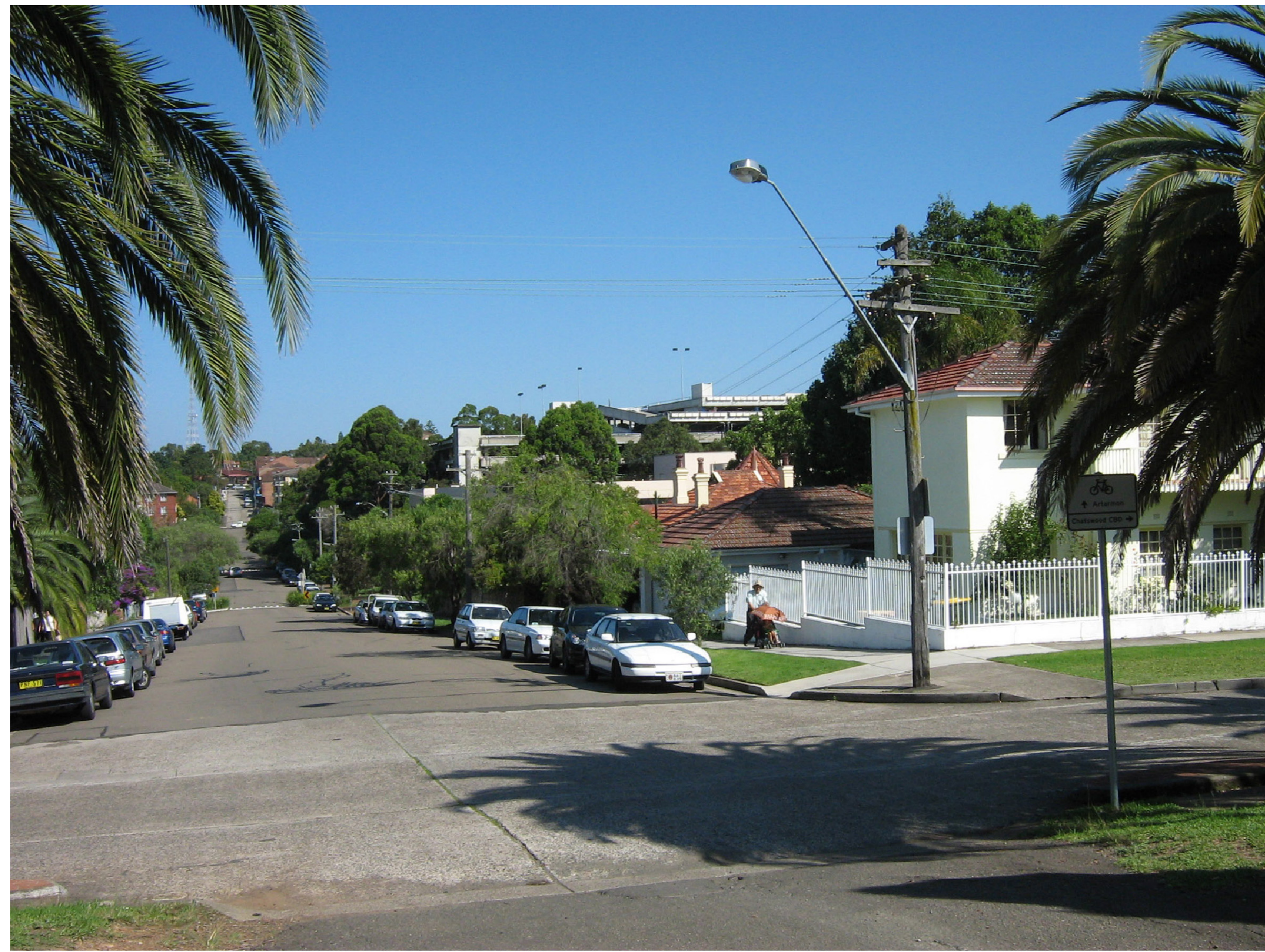
EXISTING STREETScape - NORTHERN END HAVILAH STREET