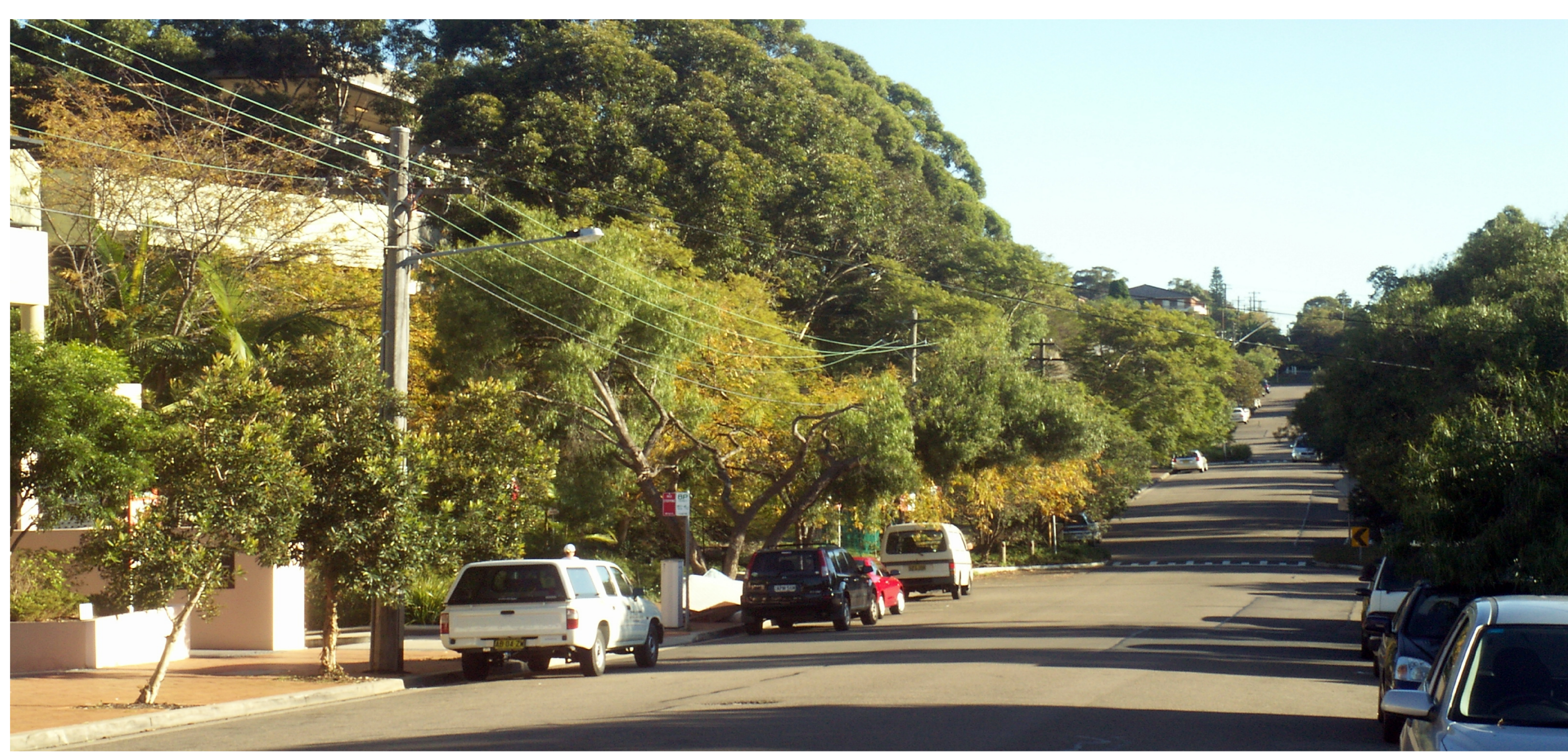
EXISTING STREETScape - HAVILAH ST