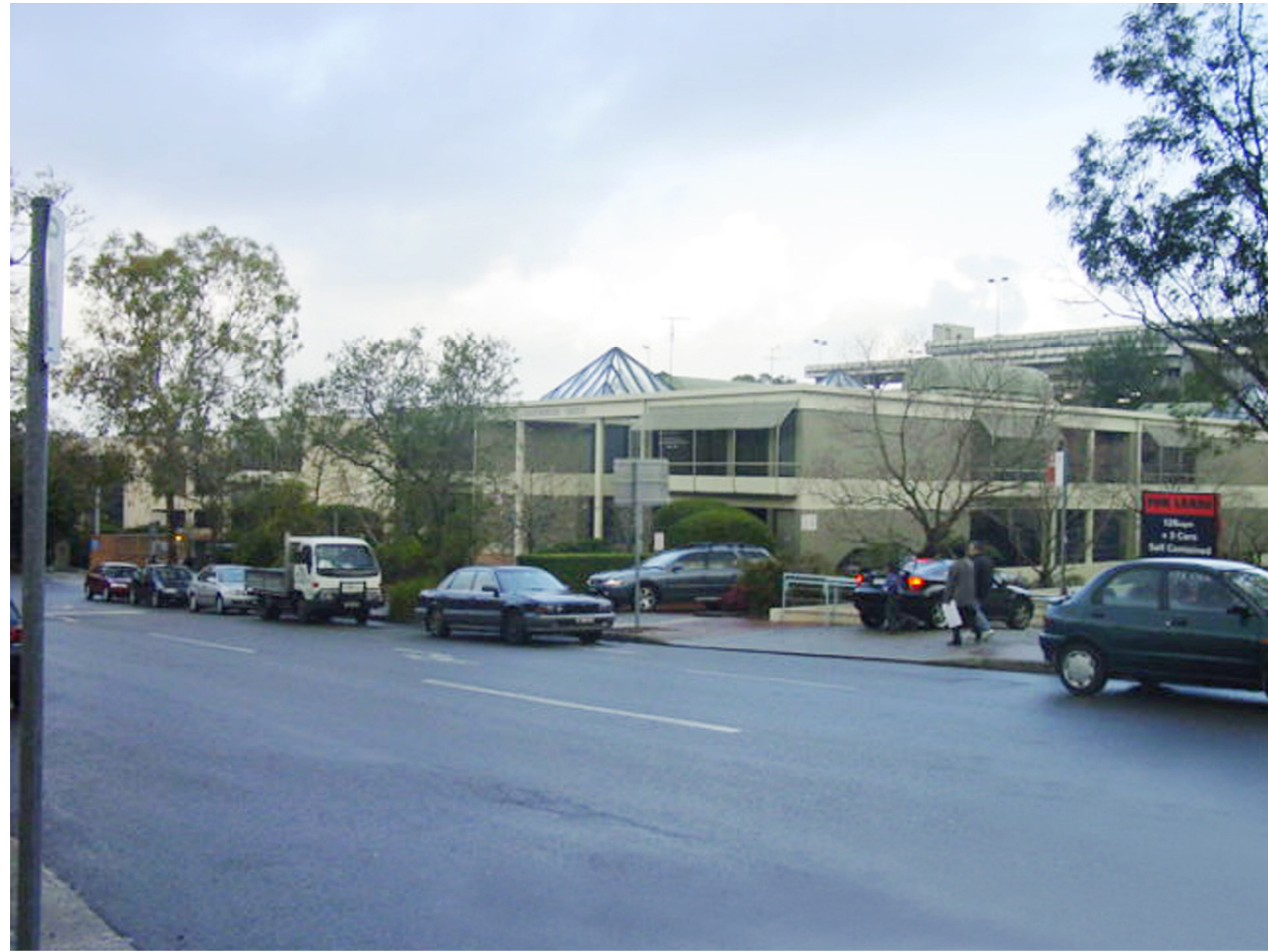
EXISTING STREETScape - WESTERN END OF MALVERN AVENUE LOOKING EAST