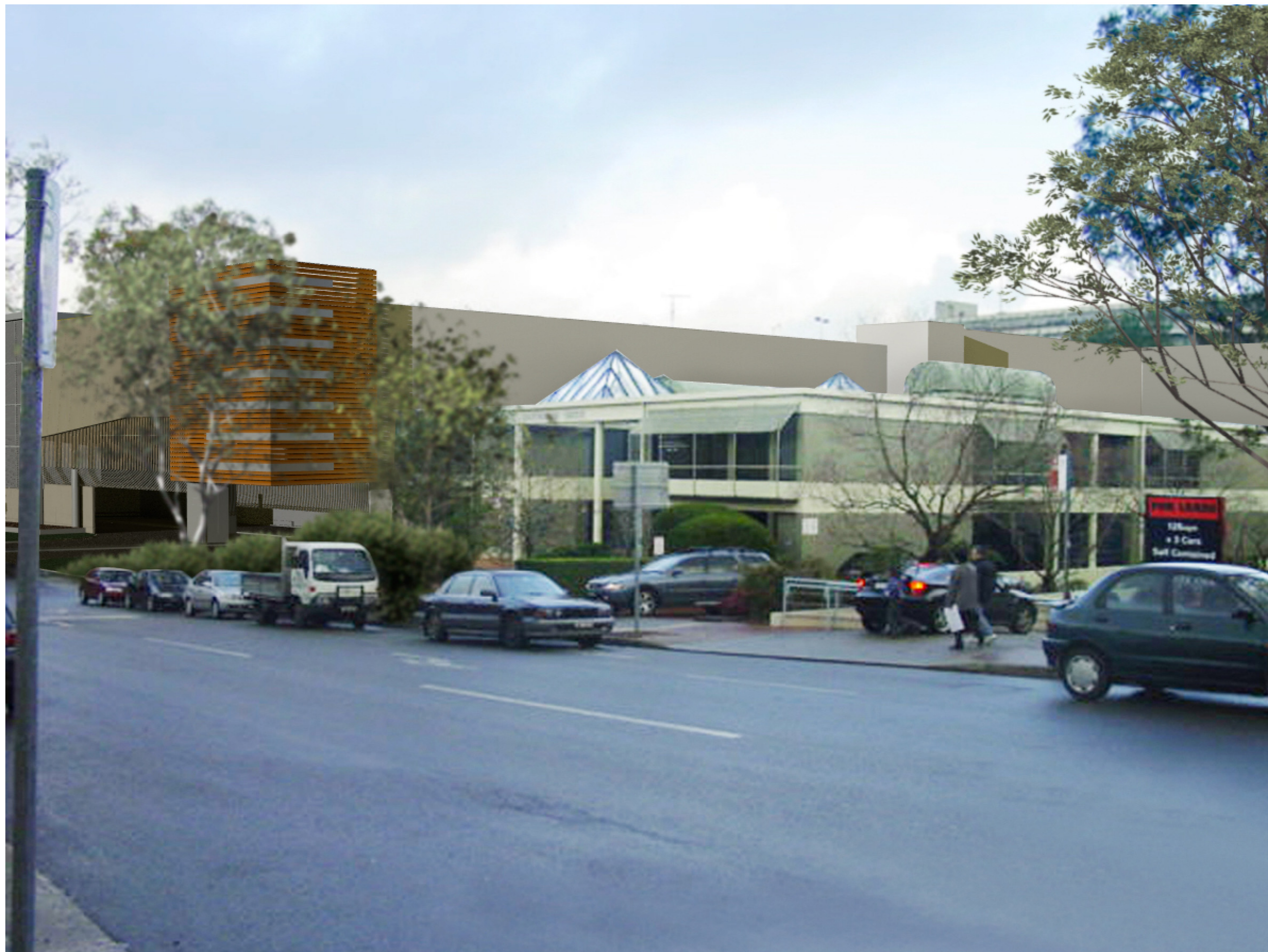
PROPOSED STREETScape - WESTERN END OF MALVERN AVENUE LOOKING EAST