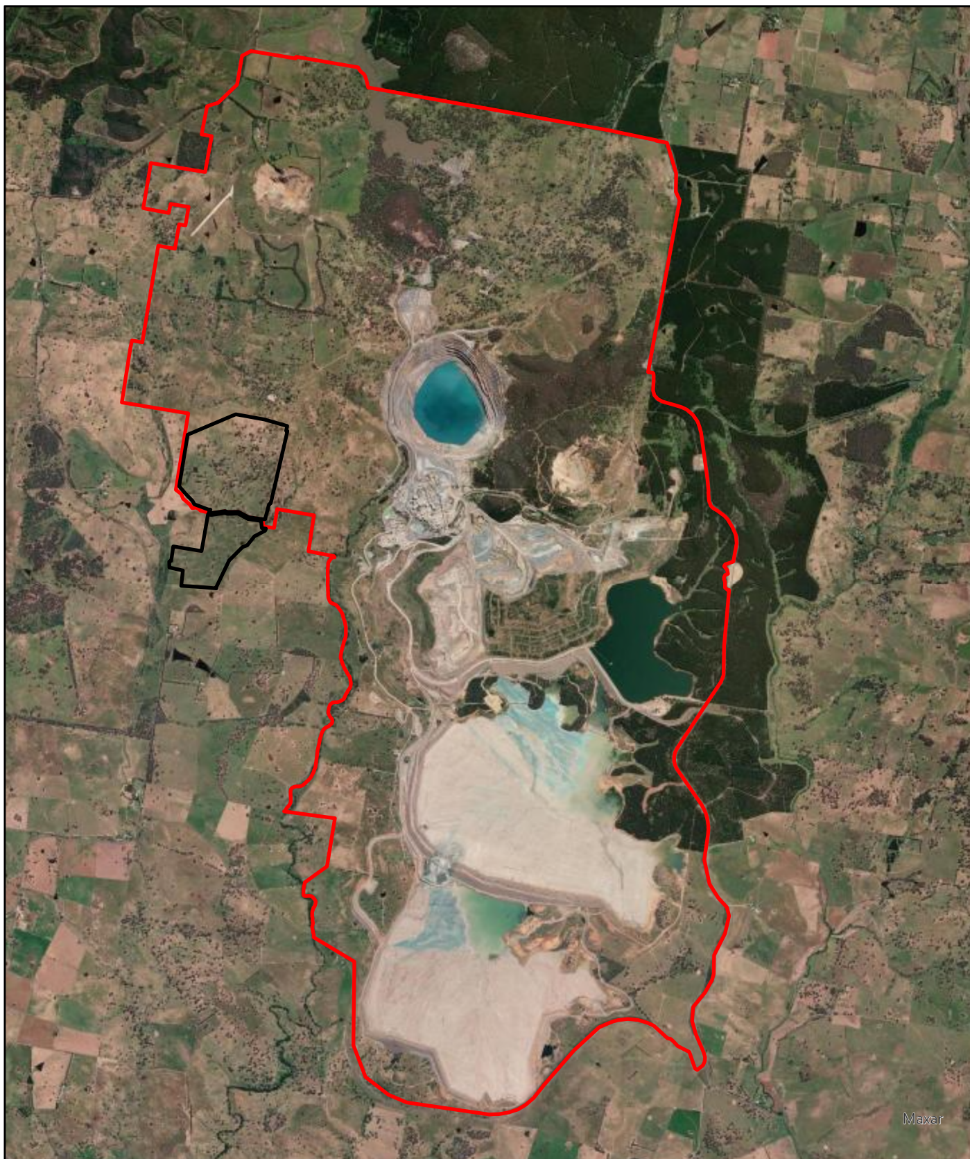
Figure 1: Proposed Location of Biodiversity Stewardship Site