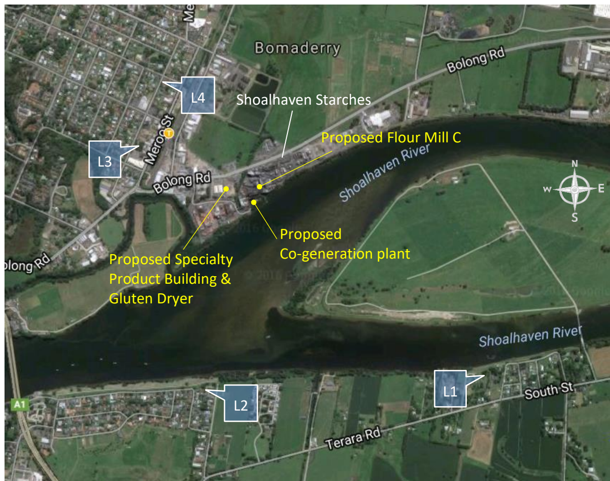
Figure 1. Location Plan – Shoalhaven Starches, Bomaderry, NSW

Distances are based on the location of the proposed Co-generation plant as a reference only, as various noise producing aspects of the proposal are at varying distances from each receptor, as is considered in all calculations. The Shoalhaven Starches site and receptor locations are shown in Figure 1 along with some of the main components of the proposal.