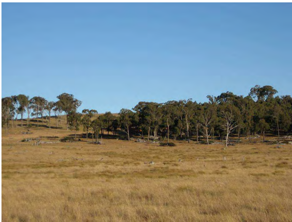
Plate 6. Community 3 – Sedgeland – darker patches in mid-ground