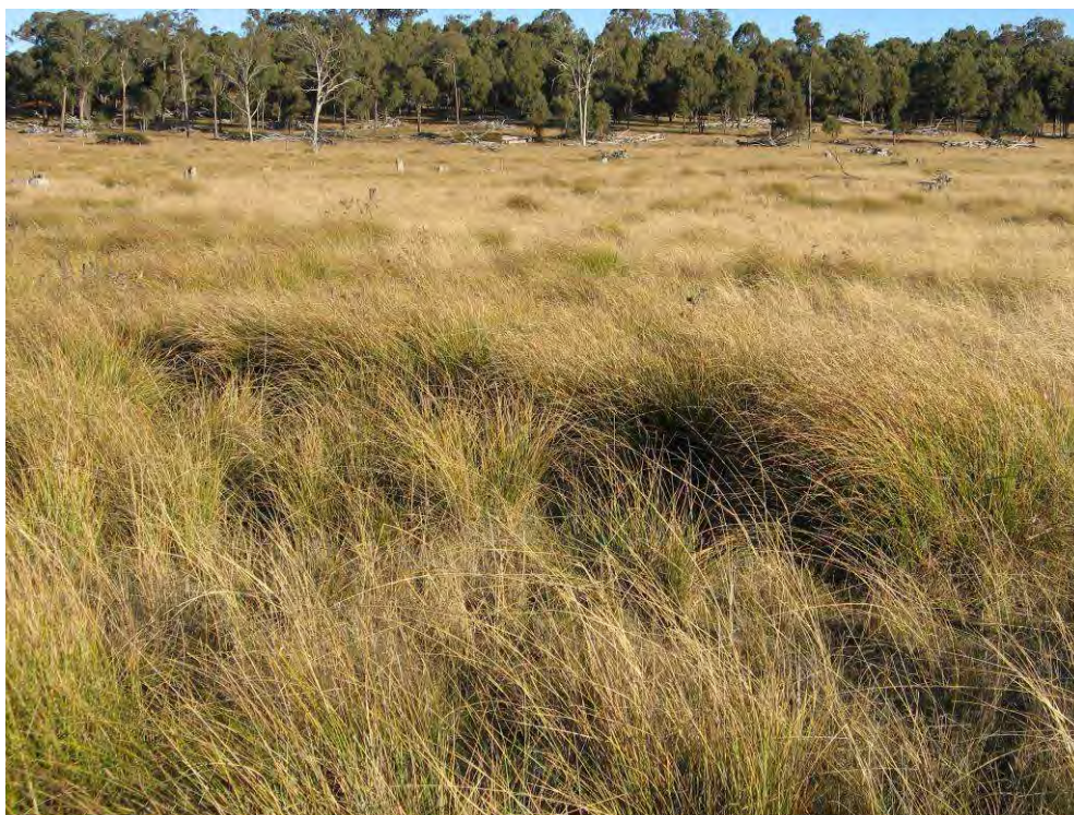
Plate 5. Community 3 – Sedgeland – close up view