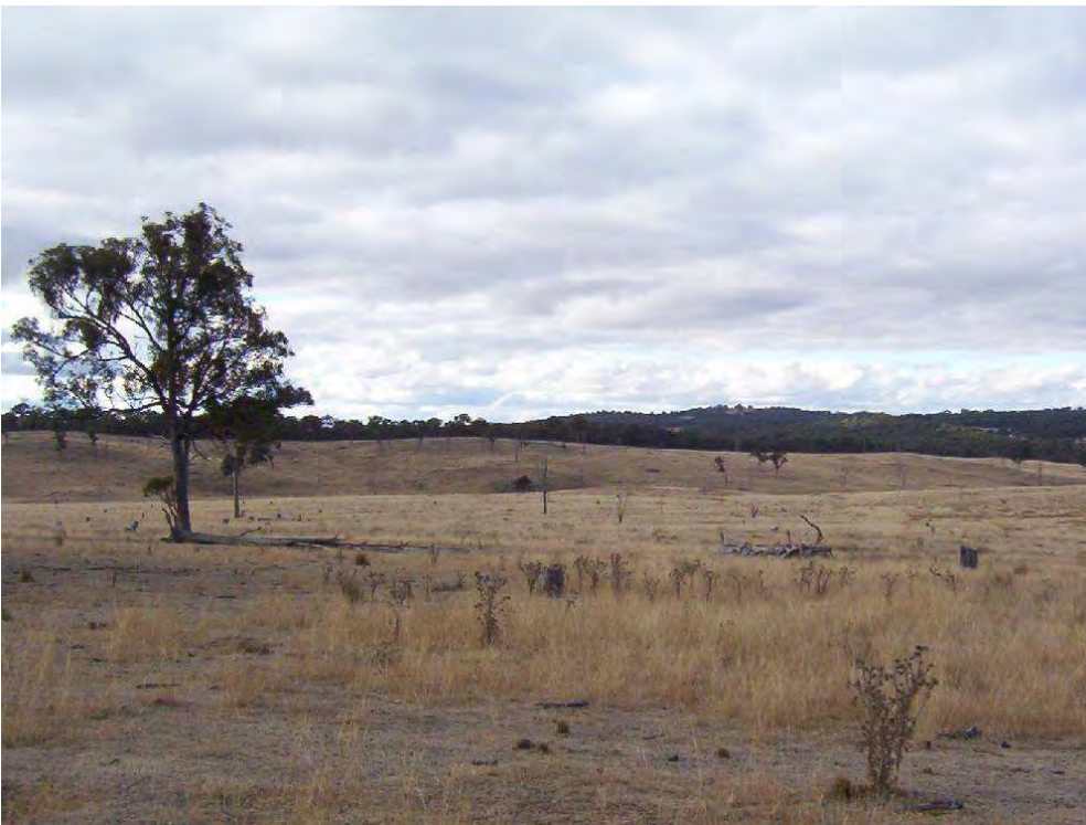
Plate 4. Community 2 – Cleared grassland – with isolated paddock tree