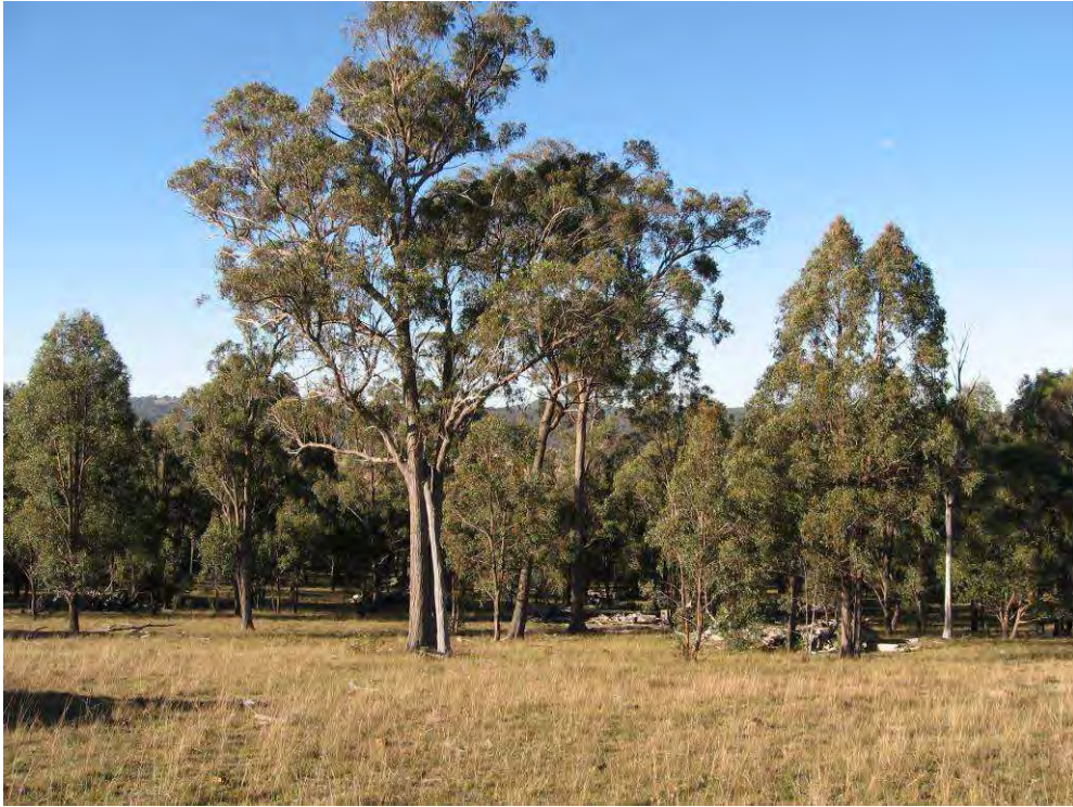
Plate 1. Community 1 – Stringybark Woodland – grassland interface