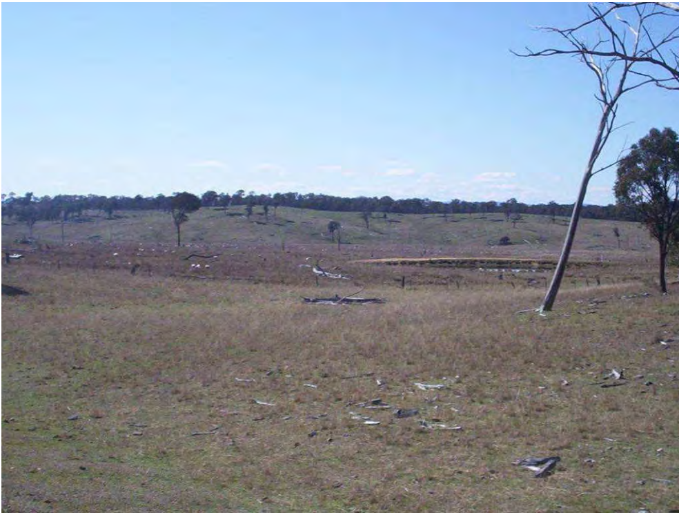
Plate 3. Community 2 – Cleared grassland – isolated stag and paddock trees in distance