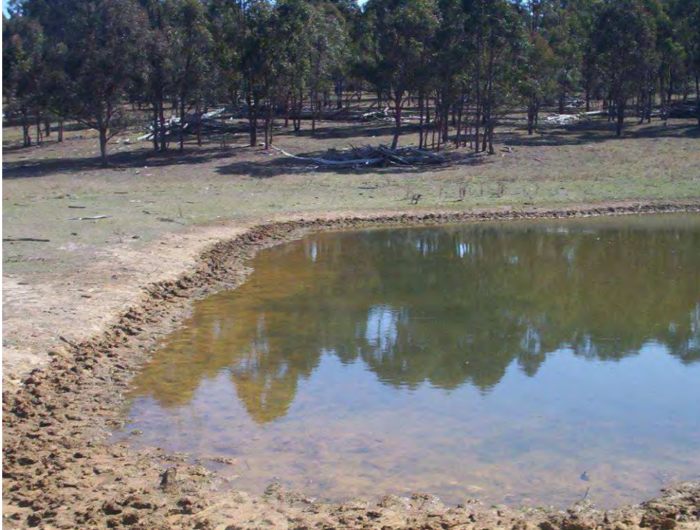
Plate 7. Community 4 – Wetlands – farm dam with stock trampled edges