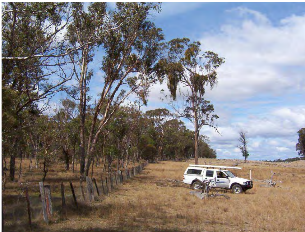
Plate 10. Community 5 – Box Gum Woodland left of fence, cleared grassland right of fence