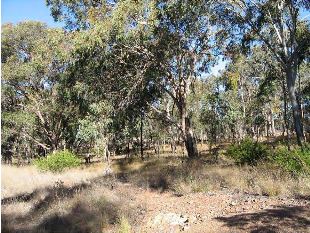
Plate 9. Community 5 – Box Gum Woodland – low regrowth on old Grafton Way road base in foreground