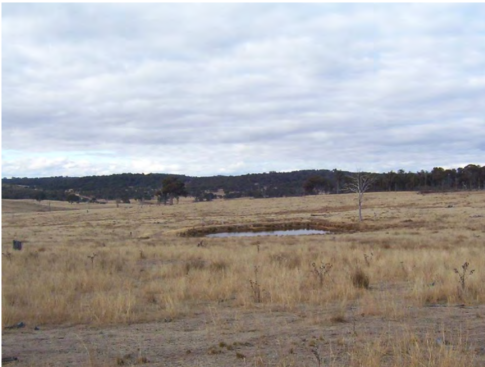
Plate 8. Community 4 – Wetlands – farm dam in low lying grassy-sedgeland