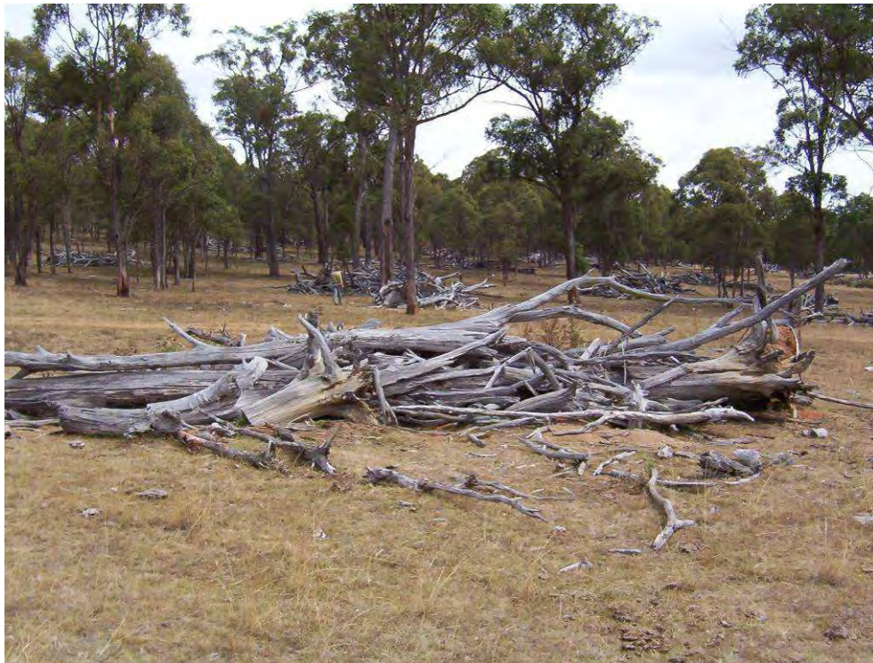
Plate 2. Community 1 – Stringybark Woodland – showing pushed up log piles