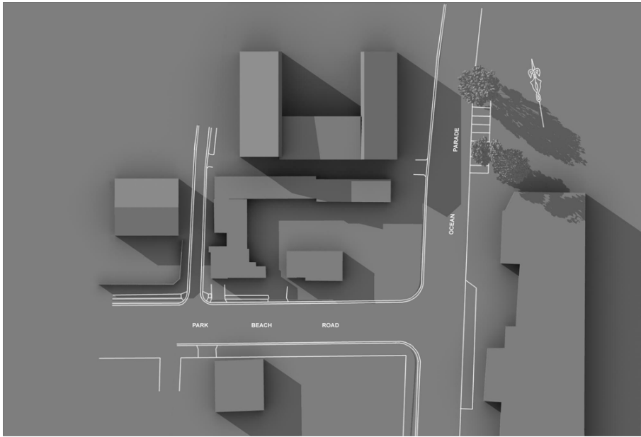
JUNE 22nd 3PM EXISTING