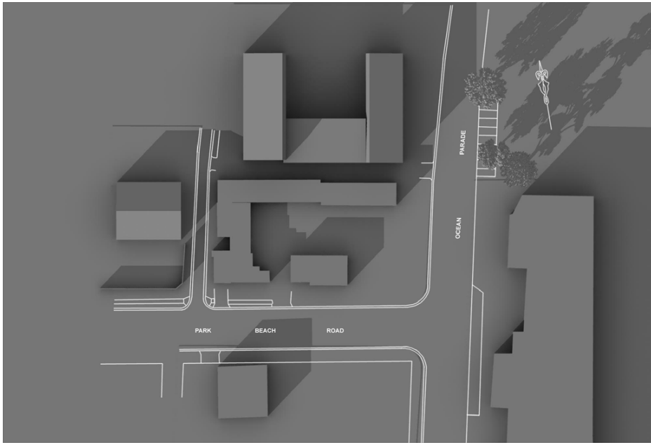
DECEMBER 22nd 6:30PM EXISTING