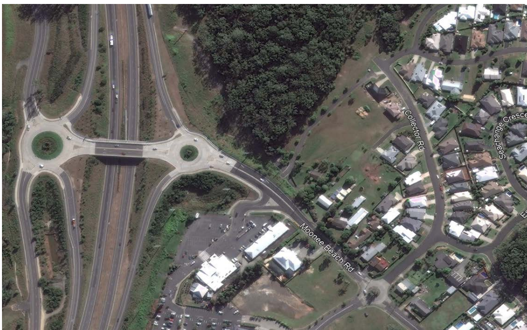
Pacific Highway/Moonee Beach Road interchange and Moonee Beach Road/Northern Collector Road roundabout.

Solitary Islands Way and Moonee Beach Road provide local road access to the Moonee Beach residential and commercial areas. Direct road access to the development is proposed through the extension of Estuary Drive (Northern Collector Road) which is a collector road already partially constructed in accordance with the Coffs Harbour City Council Moonee Release Area Development Contributions Plan 2017. The Northern Collector Road extension is approved under a separate development consent.