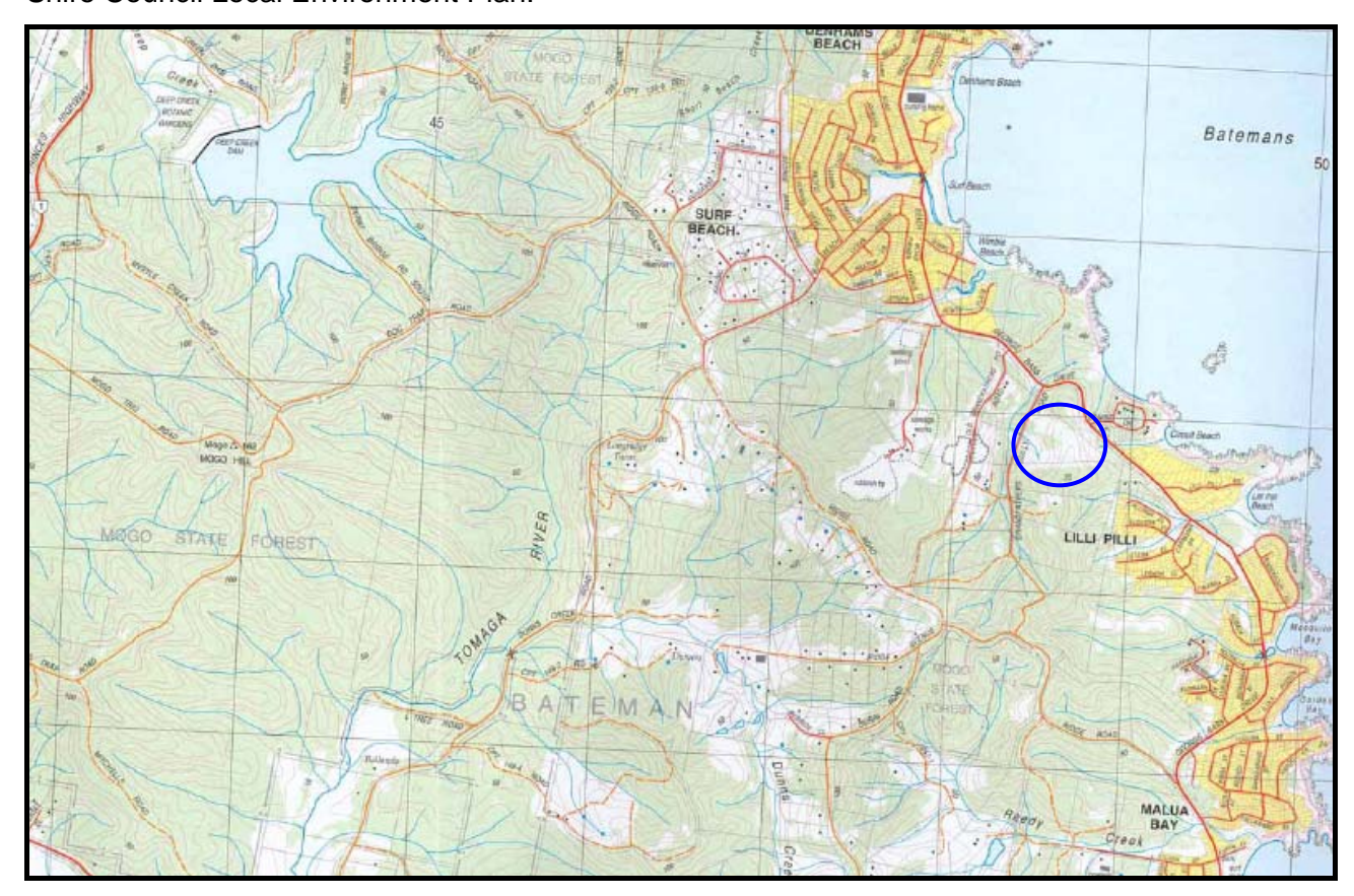
Figure 1: Location Map showing study area (blue circle outline) within the Eurobodalla Local Government Area (Mogo Mapsheet 1:25,000).

The subject site is located within the Eurobodalla Local Government Area south of the coastal town of Batemans Bay (refer Figure 1) and is zoned 1c Rural Holdings under the Eurobodalla Shire Council Local Environment Plan.