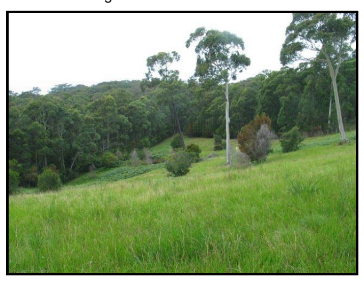
Figure 4: The southern section of the subject is also cleared. The forest vegetation visible in the background is outside of the subject site boundaries.