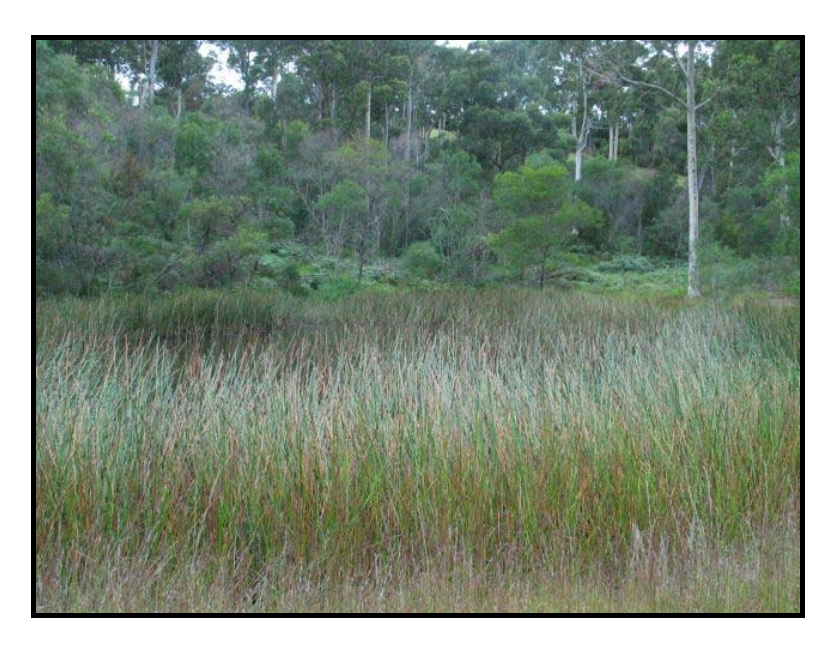
Figure 5: Fringe vegetation around the northern most dam.