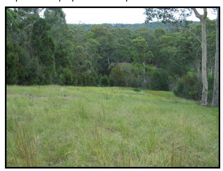
Figure 3 : Cleared upper slopes with Allocasuarina littoralis present in the riparian gullies.