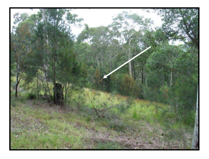
Figure 6: Allocasuarina littoralis on the western boundary of the subject site.