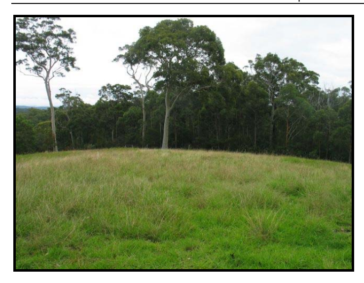
Figure 2: Much of the subject site is cleared. The forest in the background is not within the subject site, and is not part of the proposed development.