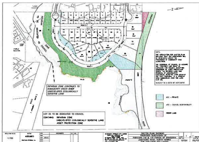
Figure 2 – Approved layout

On 15 October 2007, the then Minister for Planning granted Project Approval (06_0090) to subdivide land at Jamieson Road, North Nowra (Lots 118 & 119 DP 751258) into 35 lots including 33 residential lots, 1 lot containing a riparian zone, asset protection zone and ecologically sensitive areas and another containing a proposed road link (refer Fig 2 ).