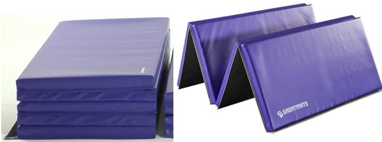
Figure 2: Examples of Typical Additional Matting Overlay.

Comparable systems may be used subject to review by Reverb Acoustics.