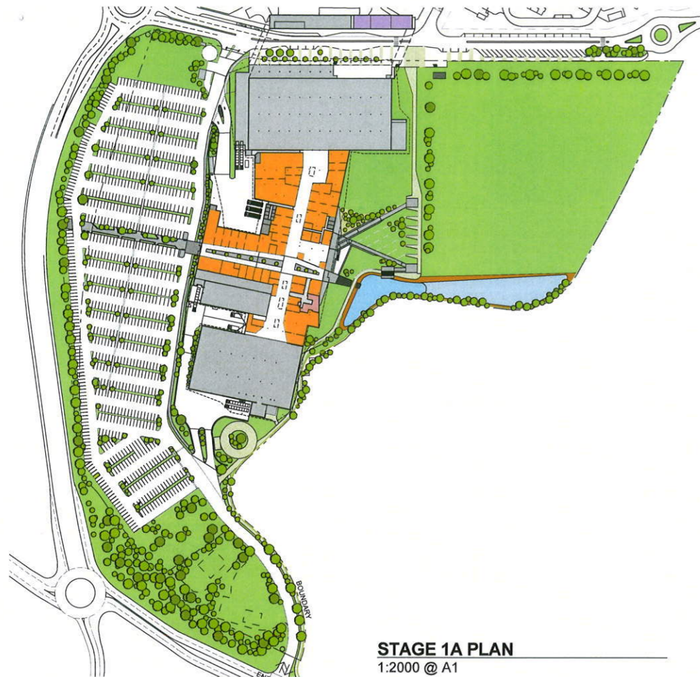
STAGE 1A PLAN 1:2000 @ A1