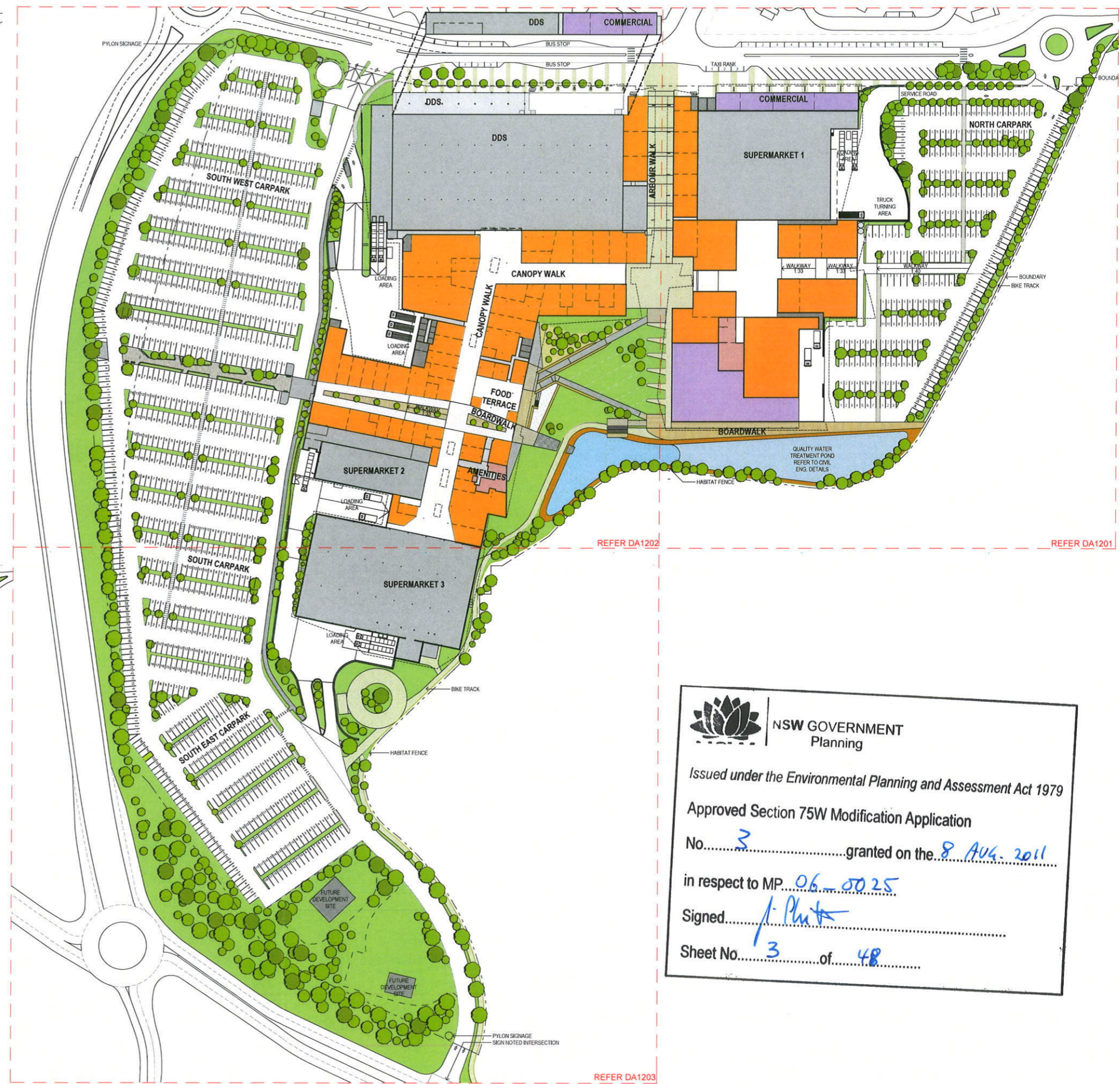
COMPLETED DEVELOPMENT PLAN 1:1000 @ A1