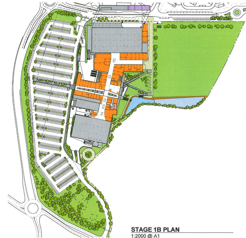
STAGE 1B PLAN 1:2000 @ A1