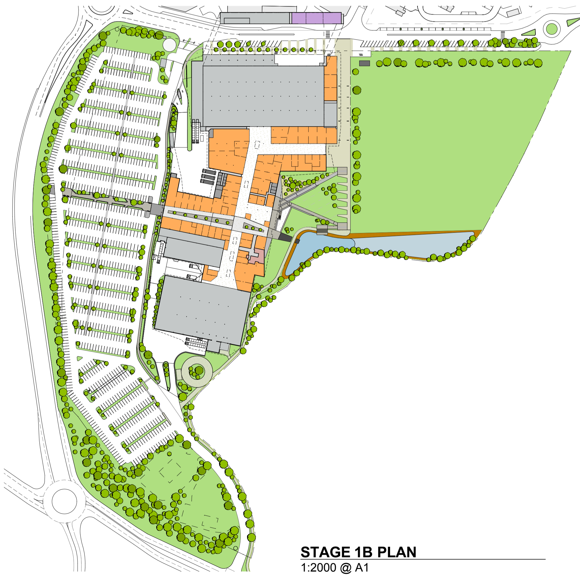
STAGE 1B PLAN 1:2000 @ A1