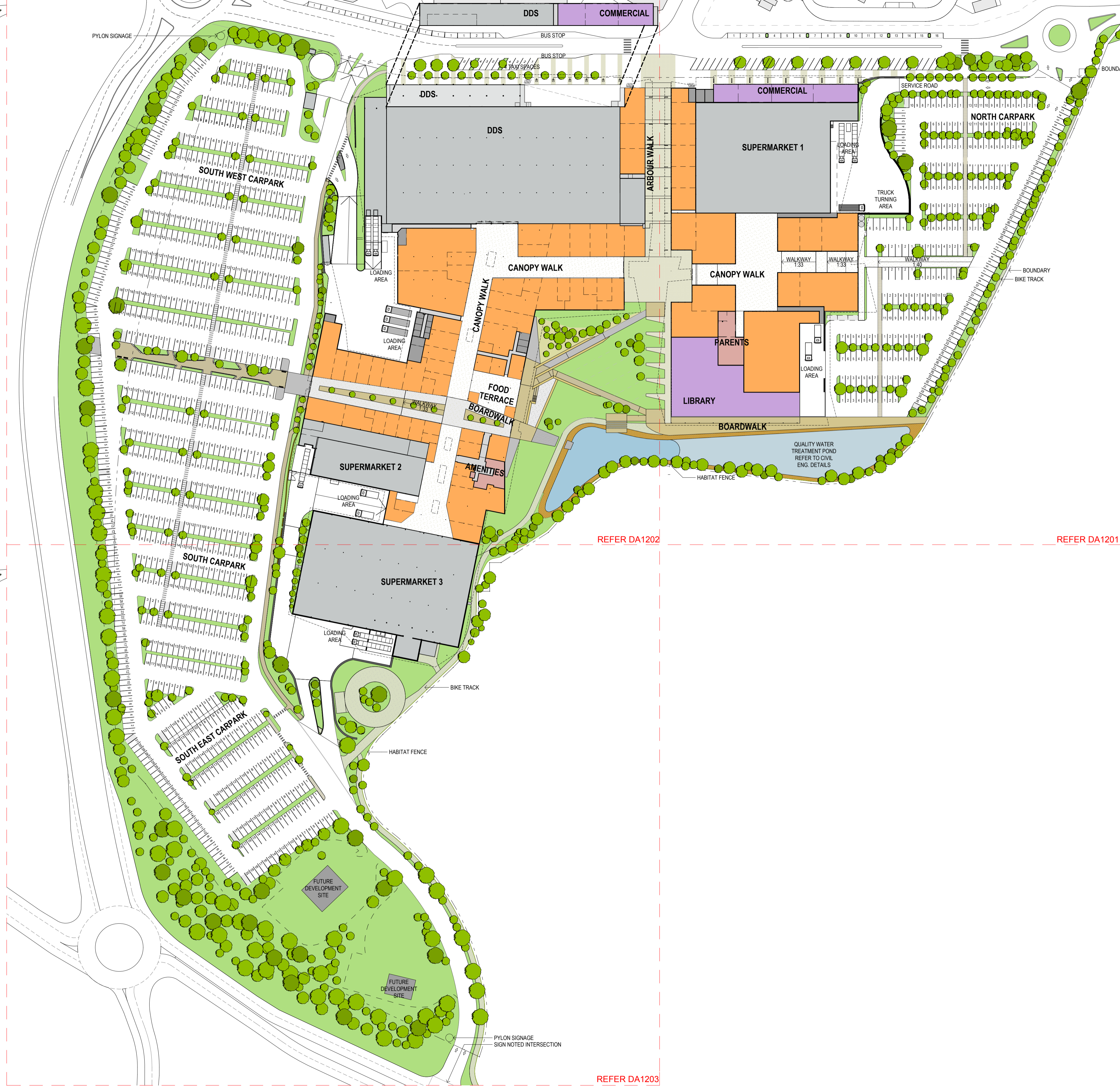
COMPLETED DEVELOPMENT PLAN 1:1000 @ A1