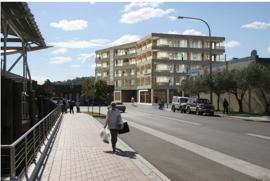
The Proposed Development as Viewed from Perry St