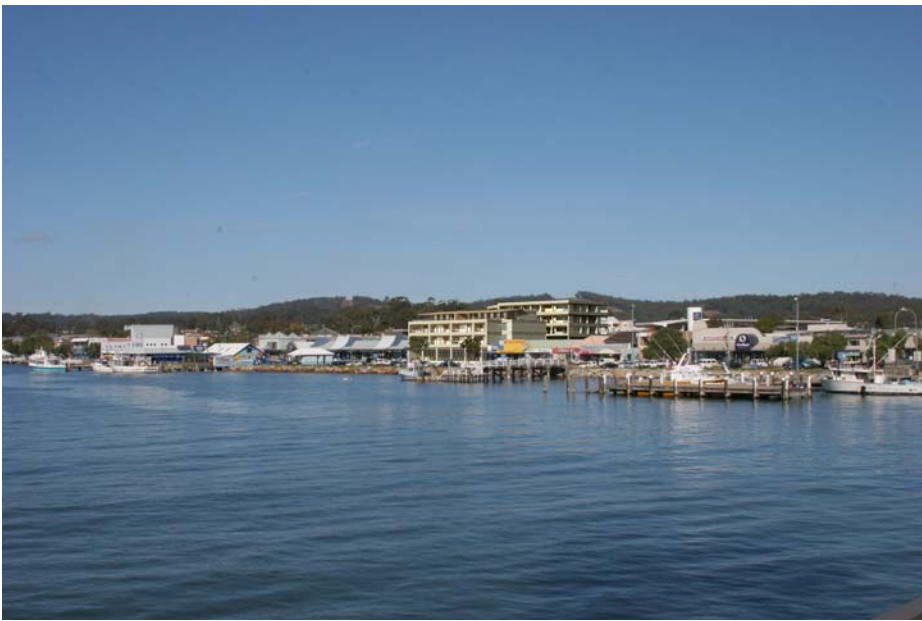
The Proposed Development as Viewed from the Bridge