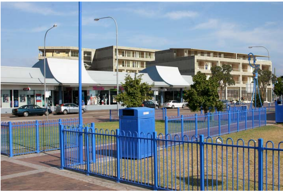
The Proposed Development as Viewed from Orient St