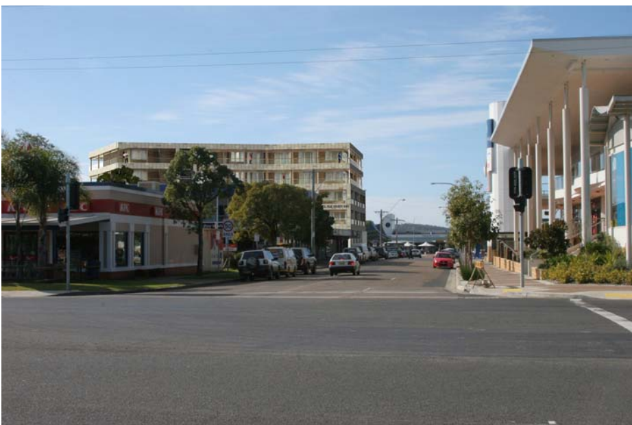
The Proposed Development as Viewed from Vesper St