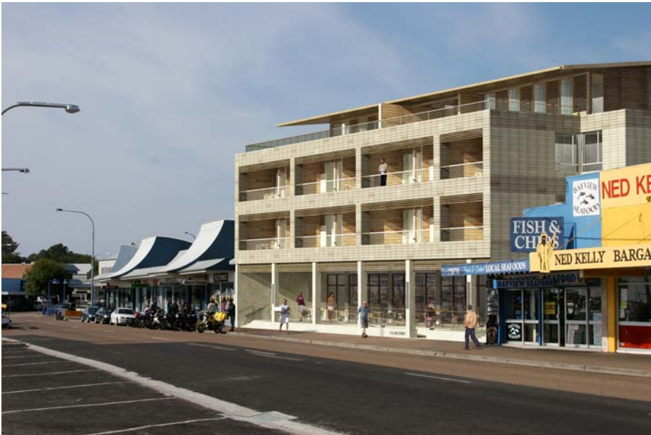
The Proposed Development as Viewed from Clyde St