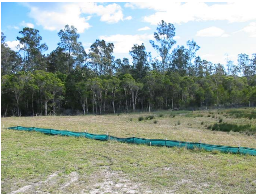
Photo 3. Swamp Oak merging into Melaleuca forest. In the foreground is Melaleuca ericifolia . Further upstream, other species of Melaleuca occur, along with Eucalyptus robusta .