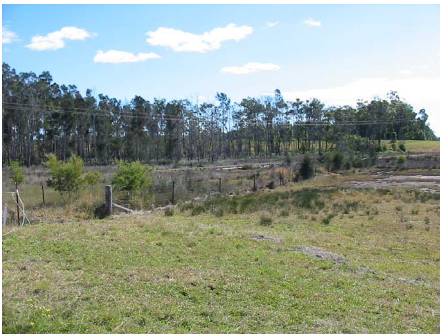
Photo 2. Swamp Oak ( Casuarina glauca ) immediately upstream of the causeway.