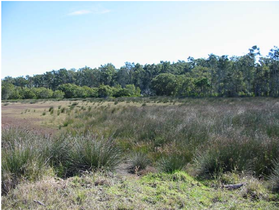
Photo 1. Estuarine wetland vegetation downstream of the causeway, showing salt meadow (dominated by Juncus spp.) in the right foreground, salt flat (dominated by Sarcocornia quinqueflora and Sporobolus virginicus ) in the left middle-ground, mangroves (dominated by Avicennia marina ) in the back ground, which are, in turn, backed by Swamp Oak ( Casuarina glauca ) and eucalypts.

A causeway constructed across the wetland as part of historical landuse activities (Figure 1) effectively limits tidal inundation such that downstream of the cause way the wetland is tidal estuarine, comprising an extensive area of saltmarsh plus mangroves along the banks of the tidal creek (Photo 1). Upstream of the causeway, Swamp Oak forest dominates, and this gradually gives way to a Melaleuca-dominated forest (Photos 2 & 3).