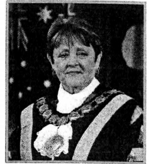
Lord Mayor Councillor Lorraine Wearne Parramatta City Council