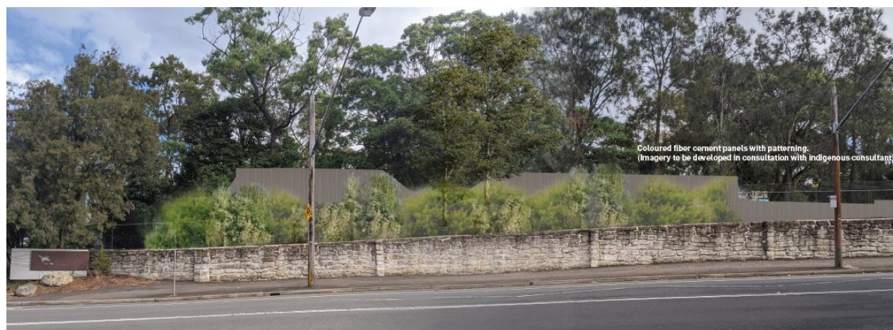
Figure 2 Updated detail on Bradleys Head Road frontage

The fence material will incorporate cement panels with indicative designs shown on the Materials and Planting Selection plan enclosed in Appendix A . The design will be further developed in consultation with an Indigenous art consultant to reflect the landscape character of Bradleys Head and the Australian character of the overall precinct.