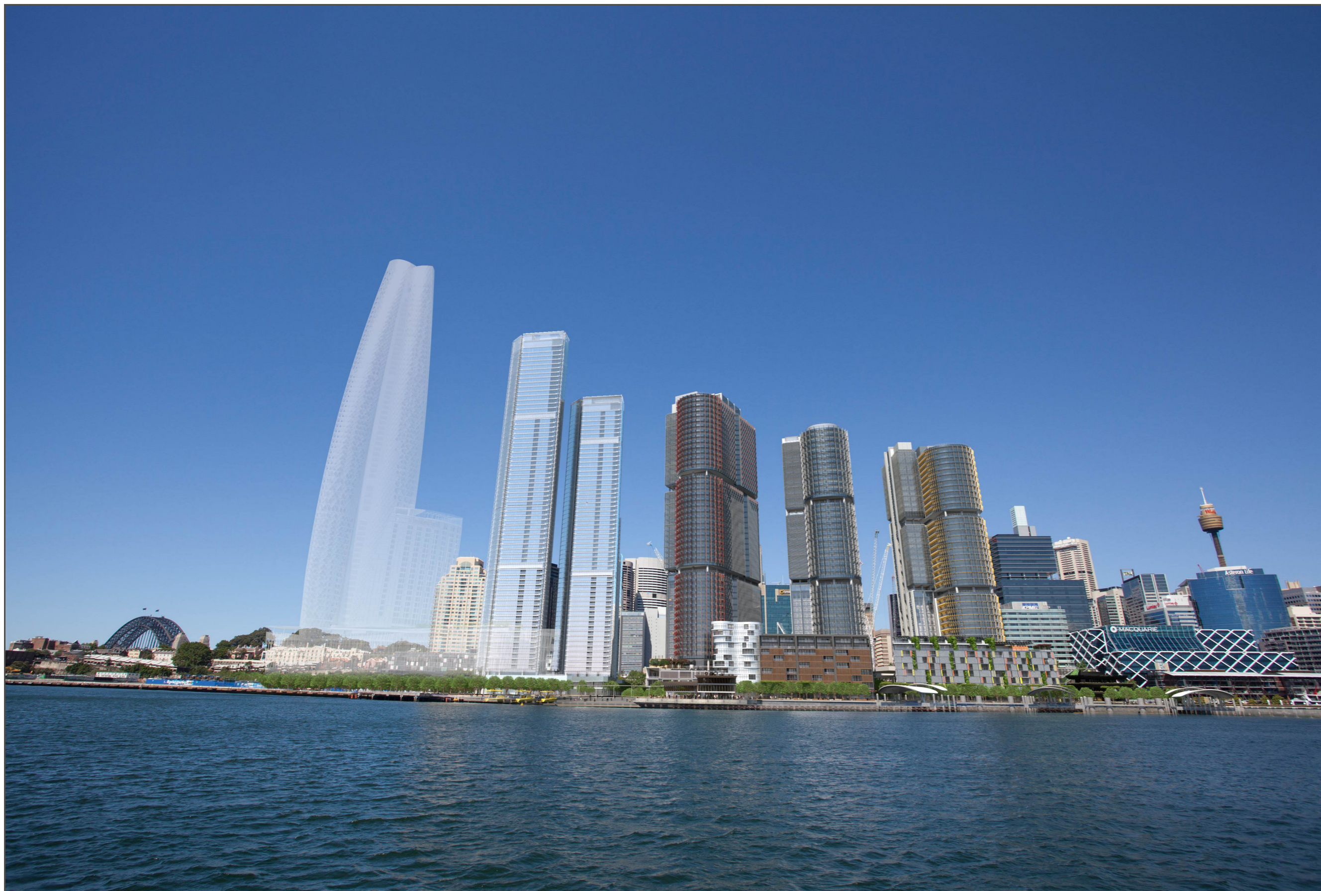
Image showing Proposed design.