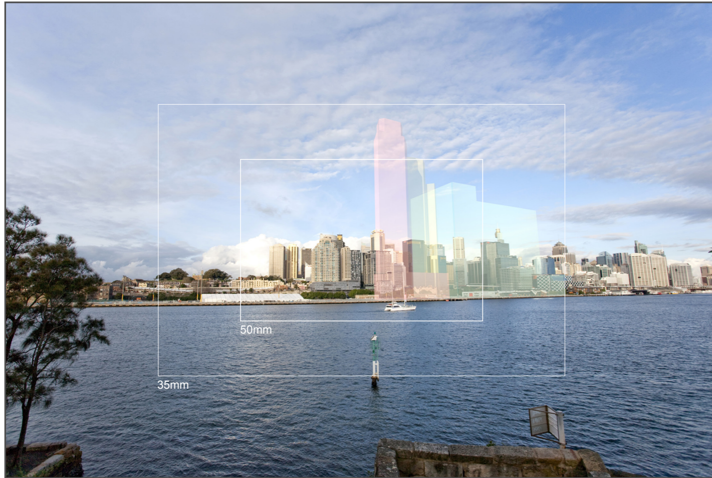
Image showing massing of the Mod 8 Concept Plan