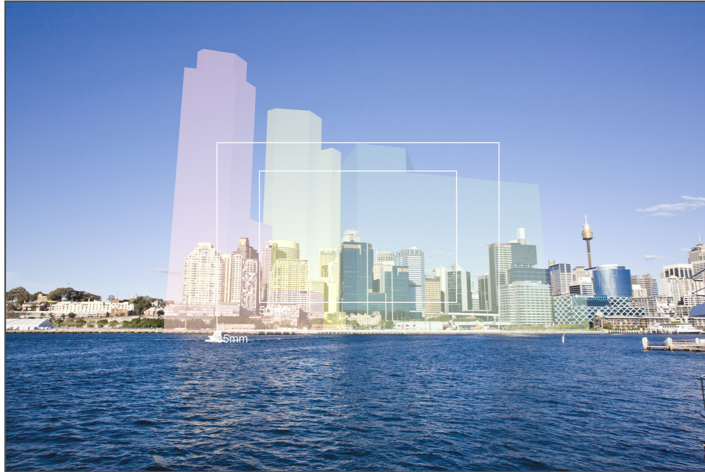
Image showing massing of the Mod 8 Concept Plan