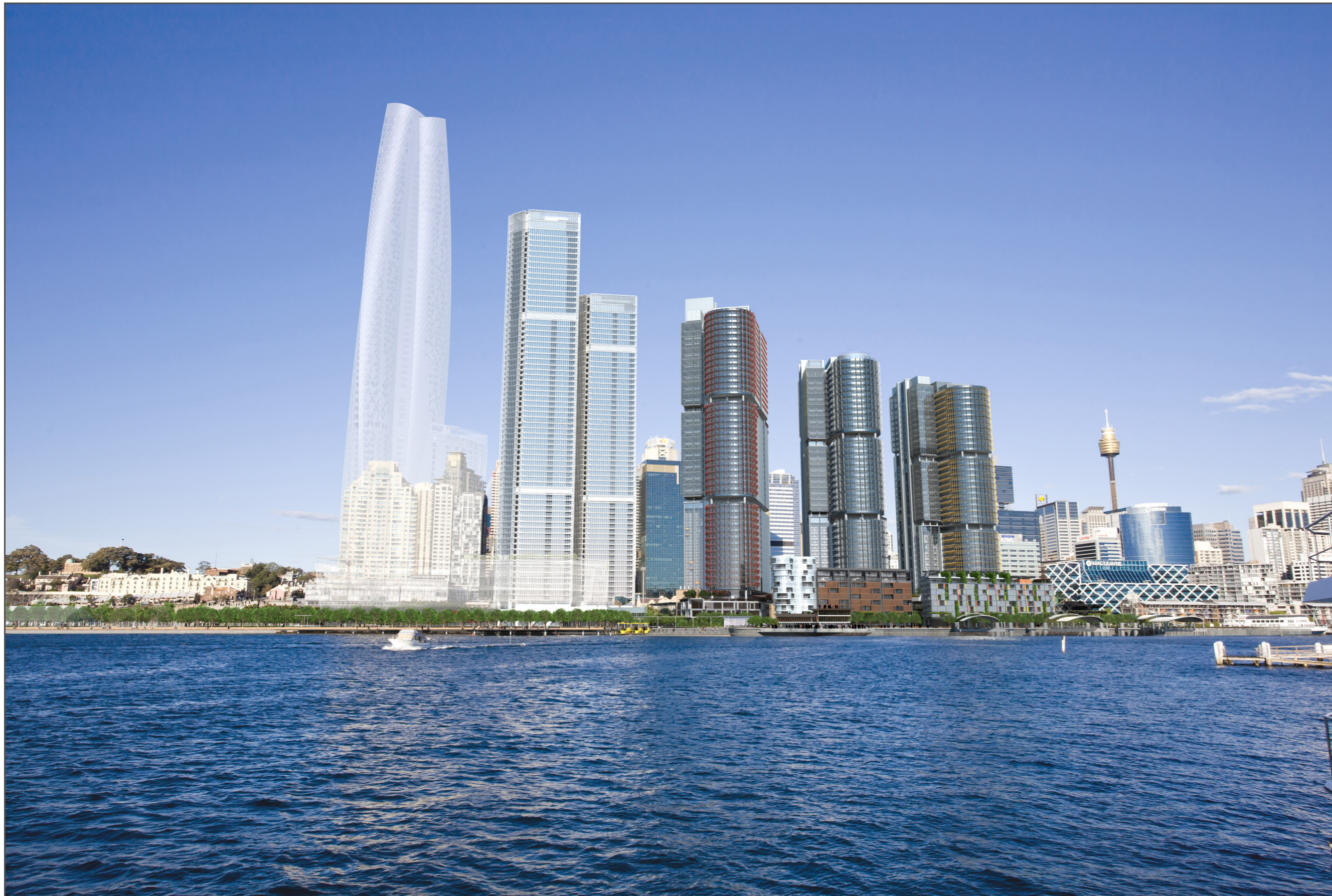
Image showing Proposed design.