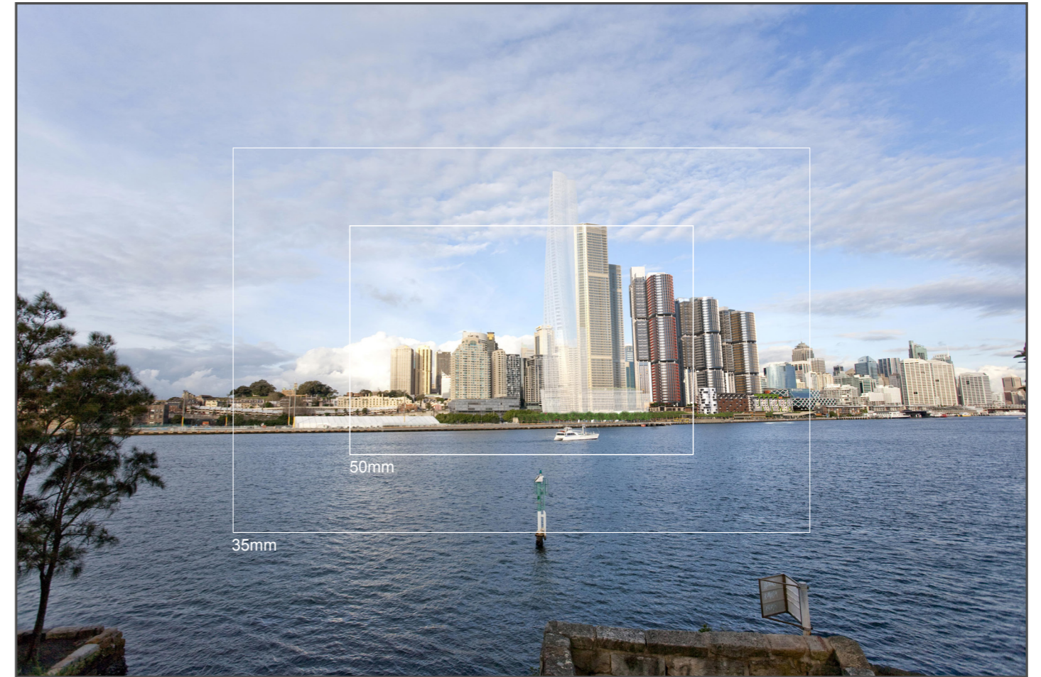
Image showing Proposed design.