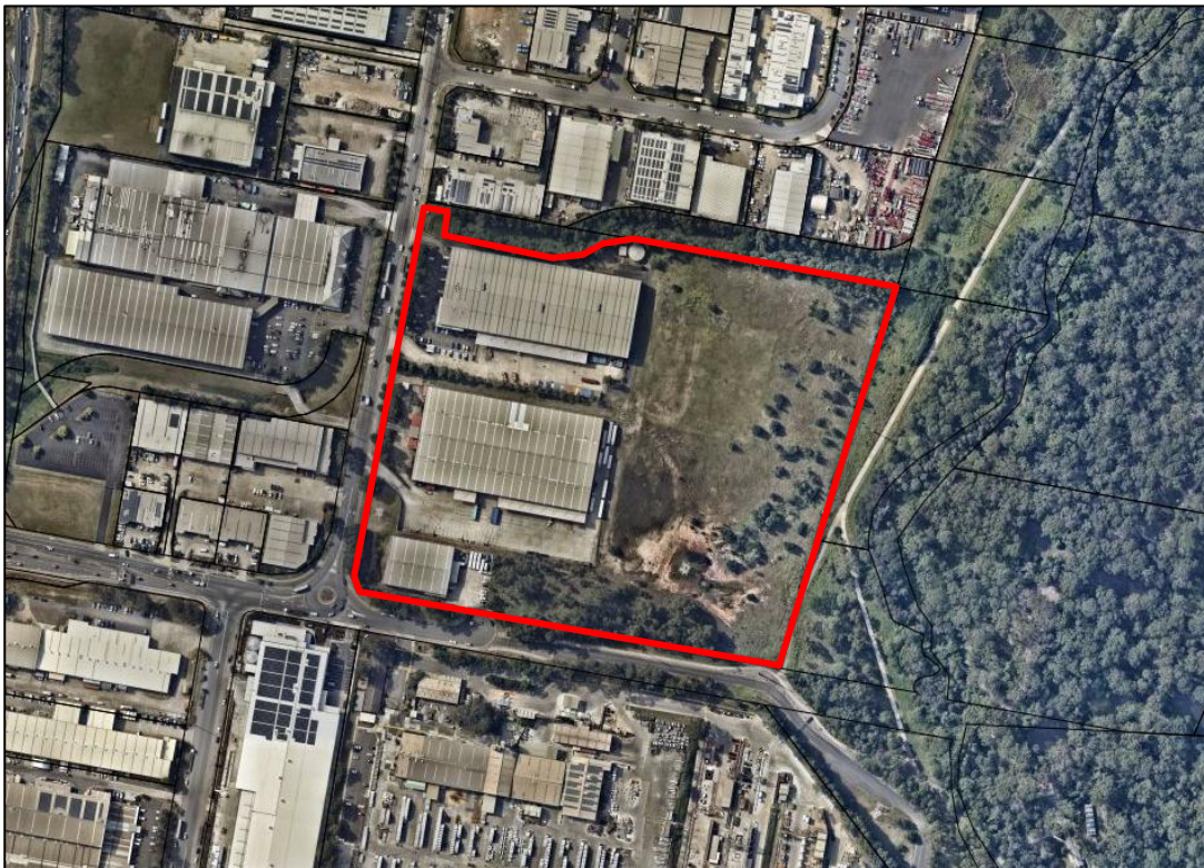
Figure 1. Aerial Map of Subject Site