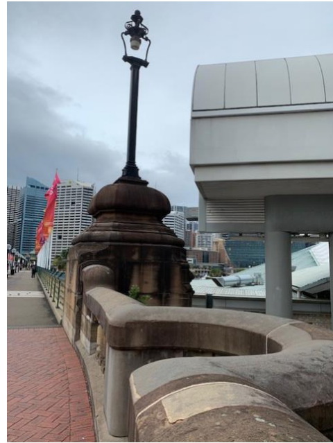
Figure 3/4: Derelict station demonstrates impact of any structures too close to historic bridge

Why is it that we seem intent on dwarfing the magnificent Heritage Bridge and building higher and higher in Sydney? Why not be more grounded and appreciate the low-rise magnificence which allows our eyes to see further and observe the existing features that are the pleasure of our Darling Harbour?