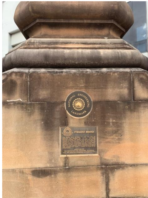
Figure 2: Heritage of Pyrmont Bridge

One of those mistakes is the derelict station still existing adjacent to the Pyrmont Bridge West approach (see Figure 3/4 ). This must be removed and NOT replaced with anything adjacent to the Historic bridge. The old station is tall and impinges of the Pyrmont Bridge due to its height and proximity.