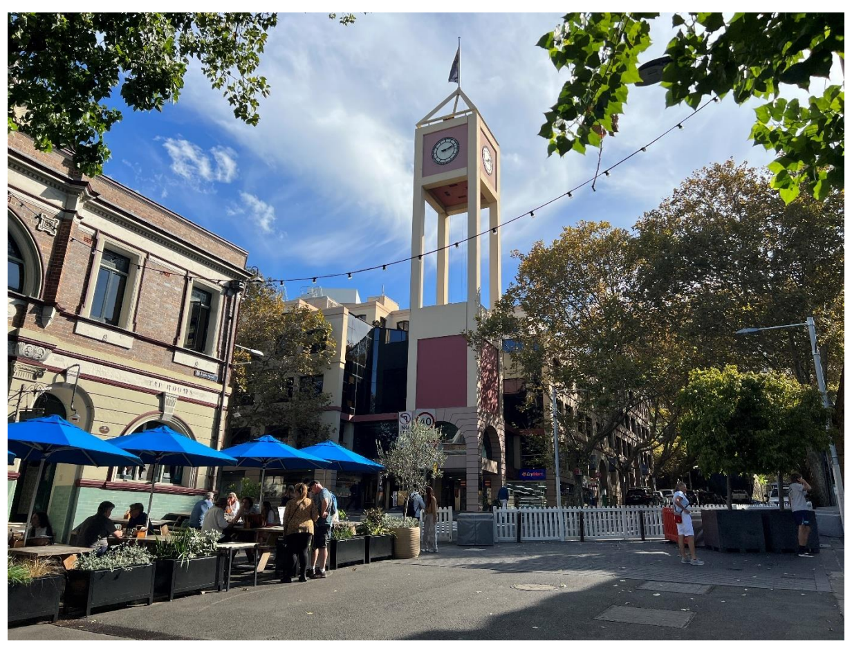
Figure 6 – Nos. 35-75 Harrington Street, The Rocks as viewed from Jack Mundey Place / Argyle Street looking west. NB: Existing Clock tower including void.

It unclear if the existing and approved SCRA shadow diagrams denote the void below the existing clock tower (see Figure 6).