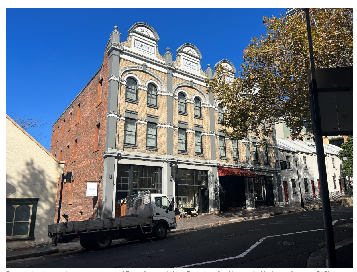
Figure 3 –Northern and western elevations of Evans Stores, Harbour Rocks Hotel' at Nos. 34-52 Harrington Street – NB: Photo taken at 2.18pm on 19 April 2023.

The northern and western facades (including fenestration) of No. 34-52 Harrington Street currently benefit from direct solar access from midday to 3pm (see in Figure 3).