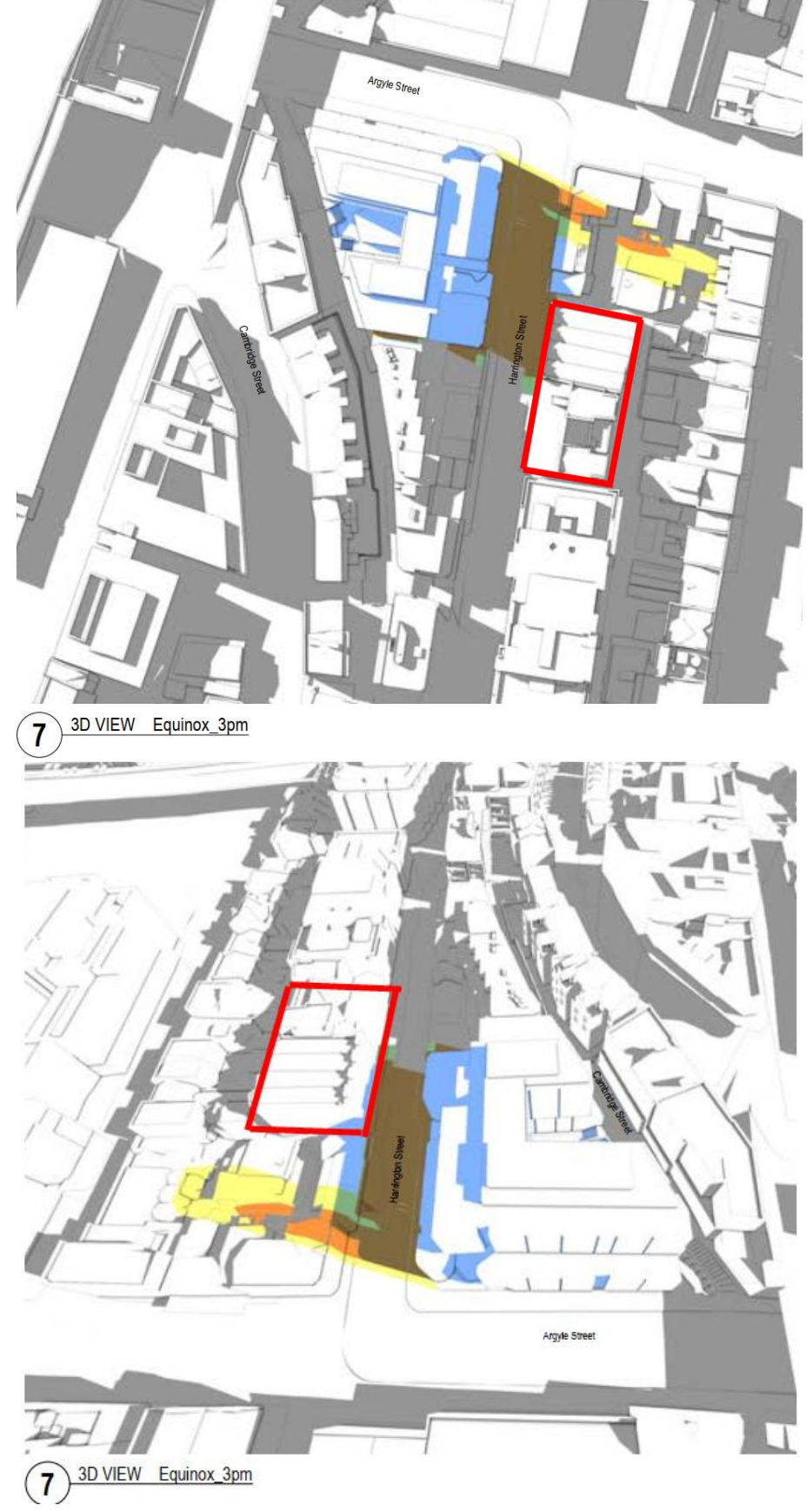
Figure 5 – Extract of applicants proposed shadow diagrams (equinox) including Nos. 34-52 Harrington Street as marked in red