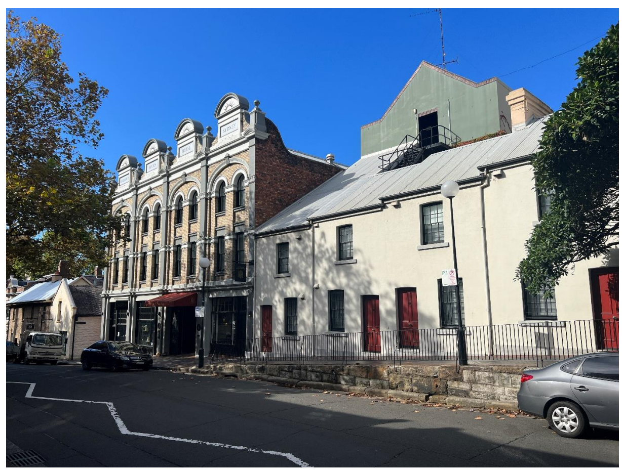
Figure 2 – 'Evans Stores, Harbour Rocks Hotel' as viewed from Harrington Street looking northeast.

Nos. 34-52 Harrington Street is located to the southeast of the development site (see Figures 1 and 2).