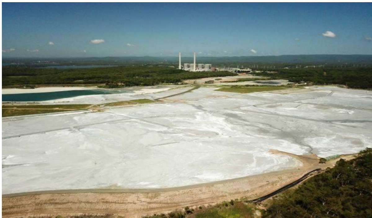
Vales Point ash dam:

Air quality contributes to many health issues whilst coal ash is blown over the suburbs and lake mixed with a concoction of illegally dumped asbestos and un-named general waste.