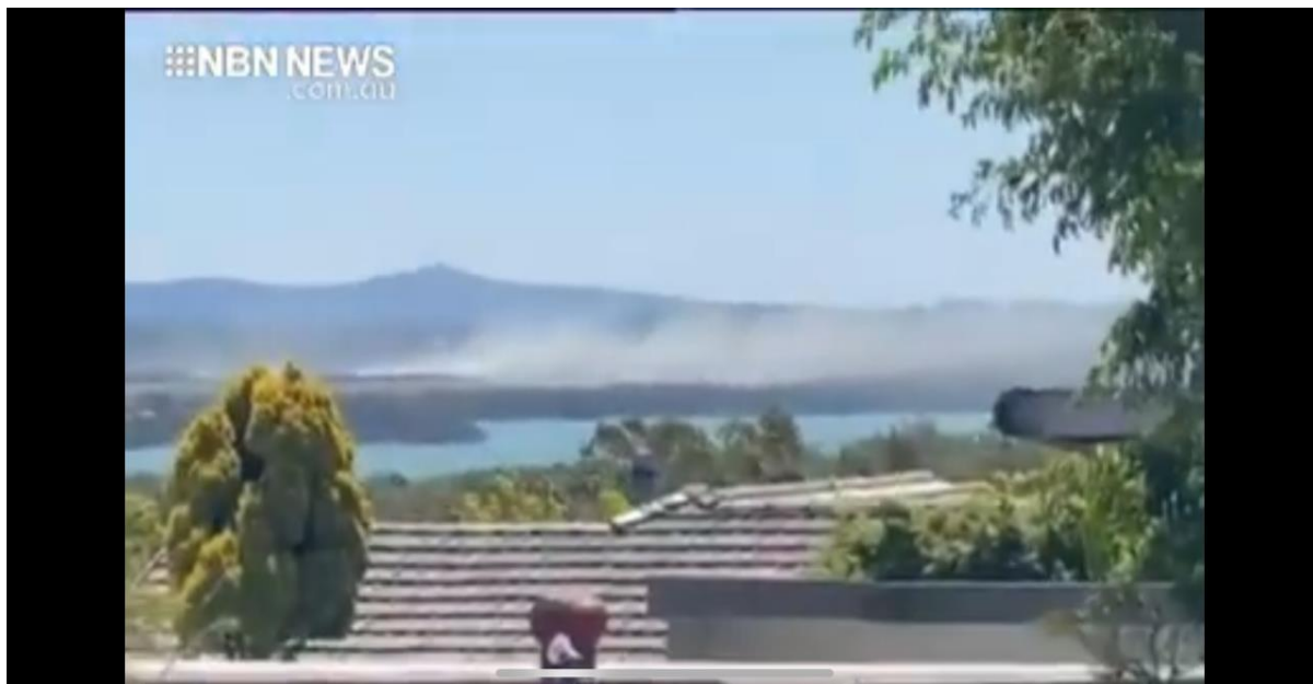
Coal ash being blown over neighbouring suburbs:

In this case legal action inquiries have begun for a class action through the NSW Environmental Defenders Office against the government and any other organisation that may ignore these damning findings and incomplete studies.