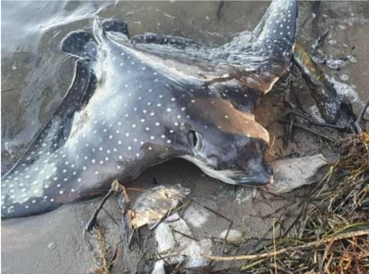
Eagle rays and fish washed up on shore in 2022

Major fish kills have recently been a regular occurrence with the EPA having little understanding of gases rising from the depth of the lake.