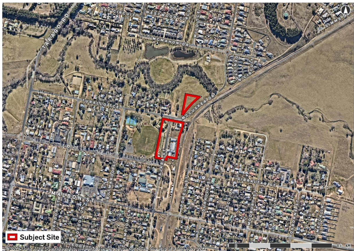
Figure 1 Site context

Bungendore Bus and Coaches also provides a school bus service for Bungendore Primary School. This bus service routes to nearby towns including Wamboin, Tarago, Hoskinstown and Butmaroo.