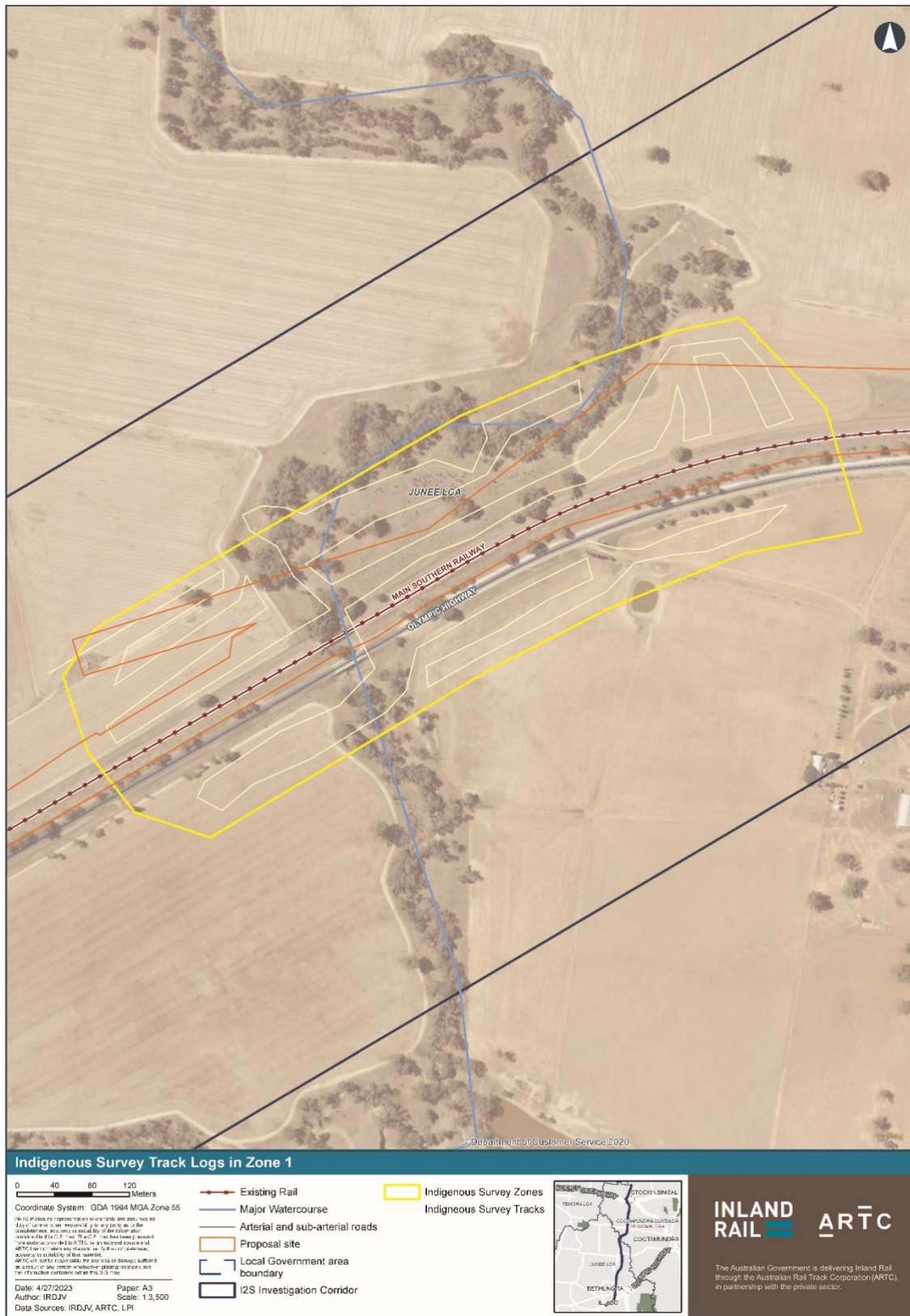
FIGURE 3 SURVEY TRACK LOGS IN I2S ZONE 1

Figures 3-9 outline the mapping of the areas subject to survey as per Requirement 5 of the Code of Practice for Archaeological Investigation of Aboriginal Objects in NSW 2010 . The survey locations are located within the I2S proposal study area.