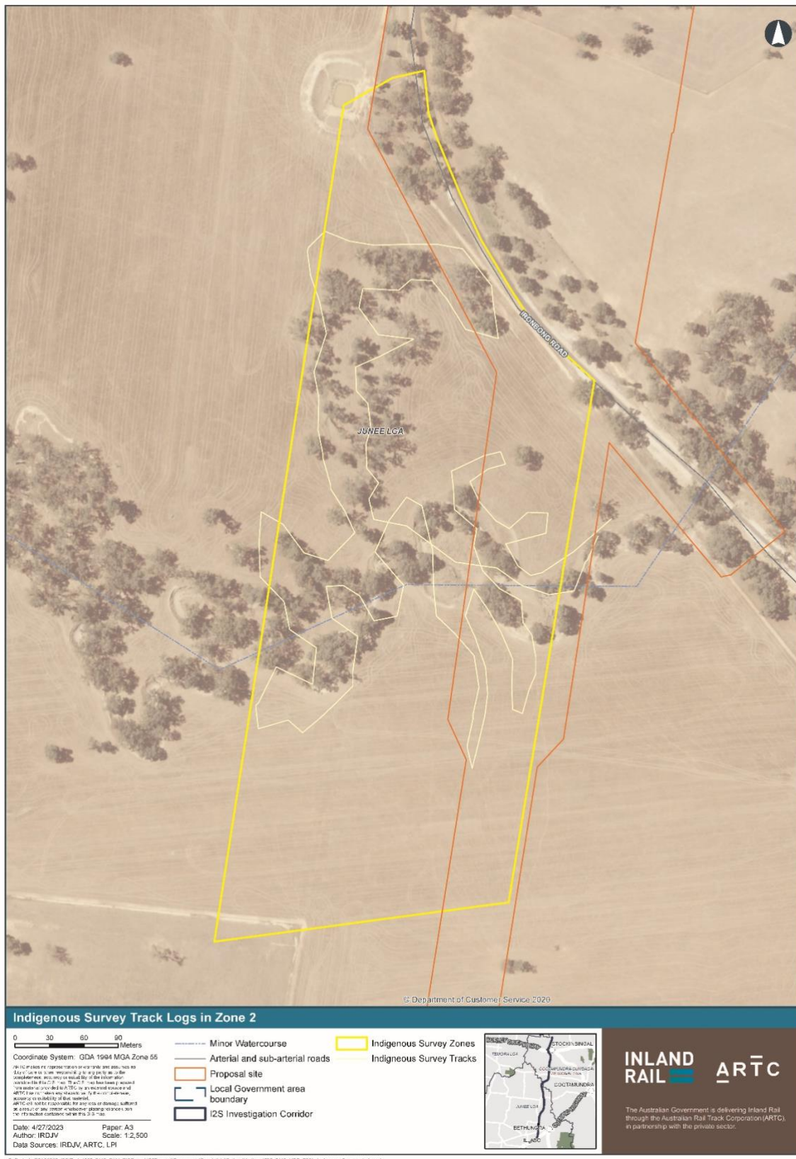
FIGURE 4 TRACK LOGS IN I2S ZONE 2