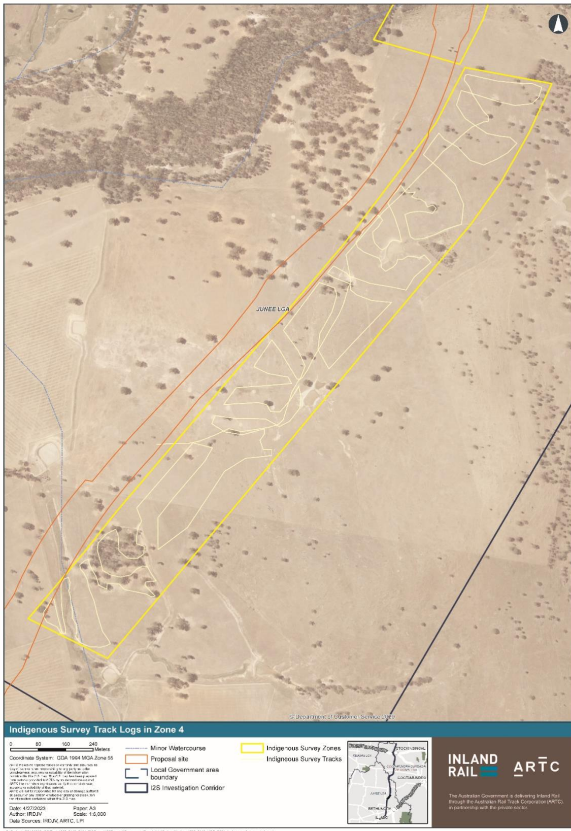
FIGURE 6 TRACK LOGS IN I2S ZONE 4