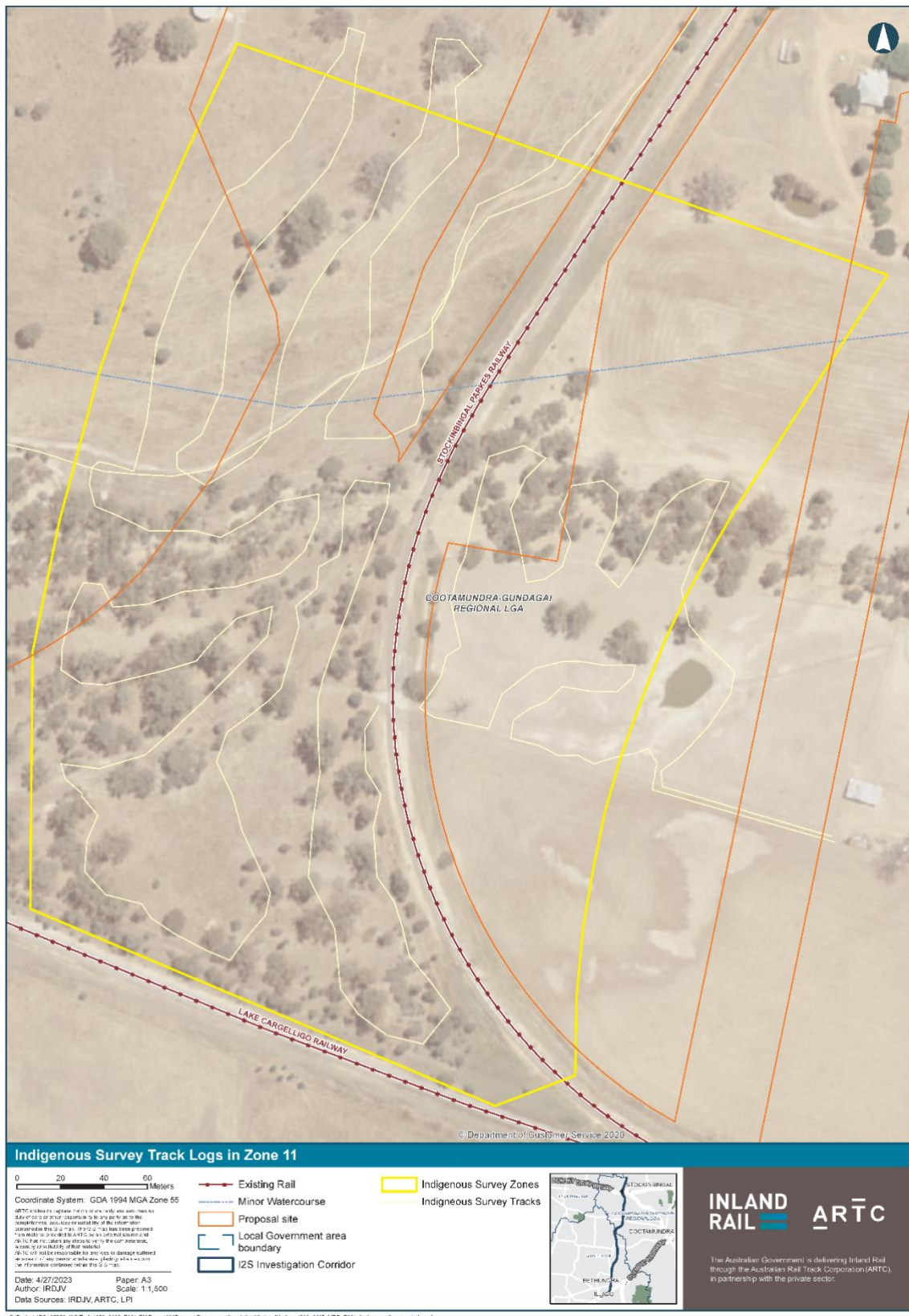
FIGURE 9 TRACK LOGS IN I2S ZONE 11