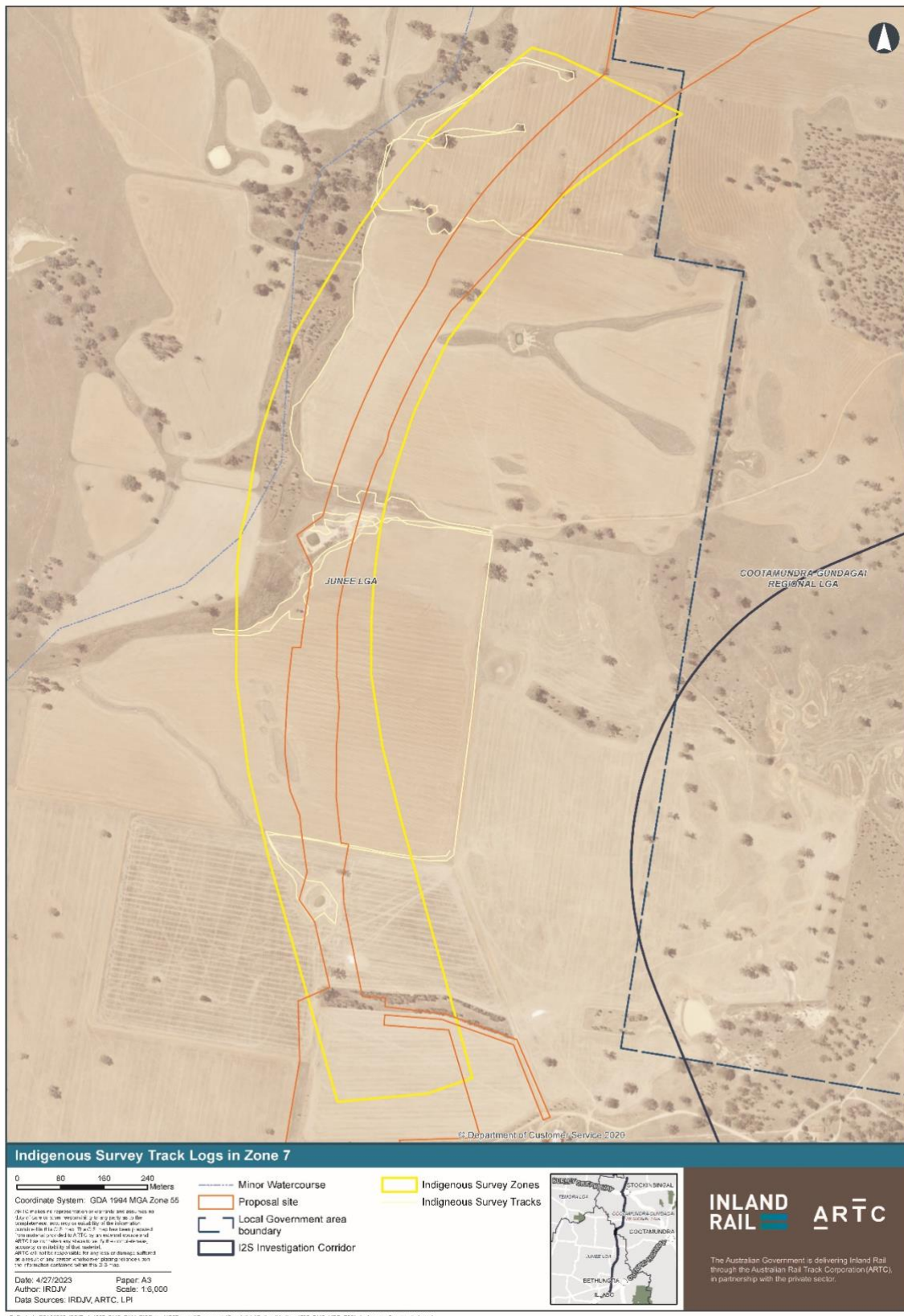
FIGURE 7 TRACK LOGS IN I2S ZONE 7