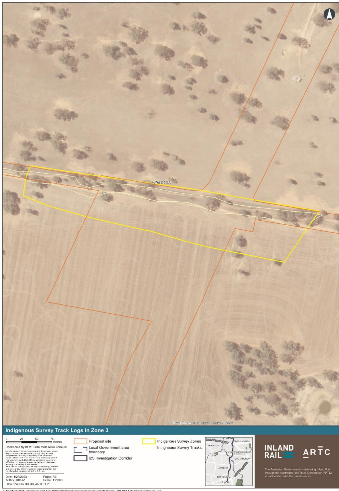
FIGURE 5 TRACK LOGS IN I2S ZONE 3