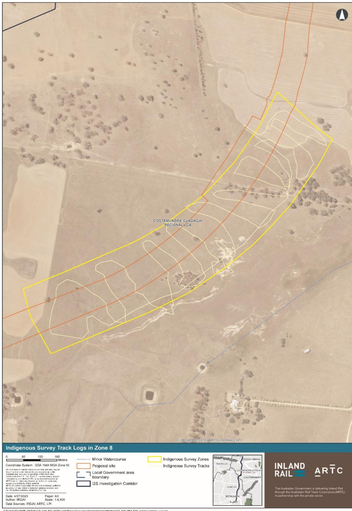
FIGURE 8 TRACK LOGS IN I2S ZONE 8