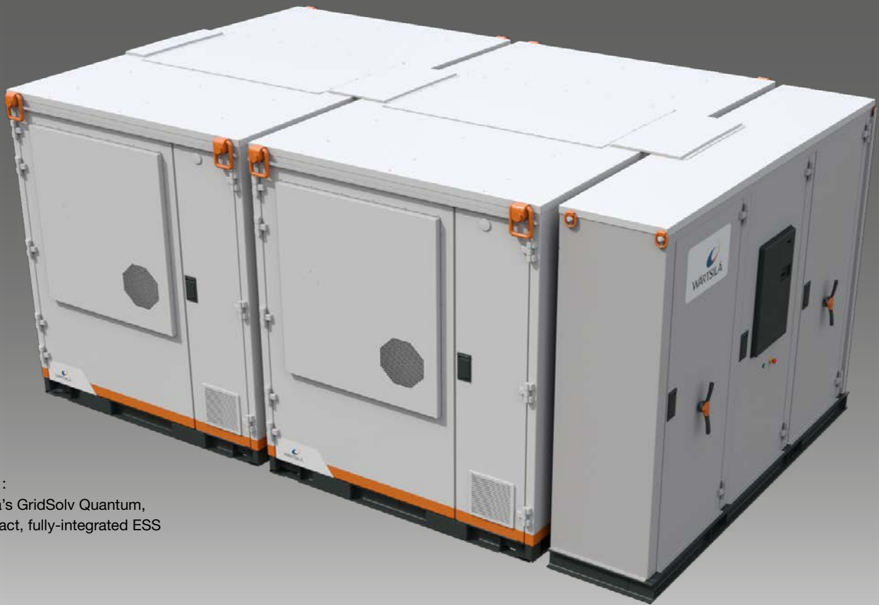
Figure 1: Wärtsilä's GridSolv Quantum, a compact, fully-integrated ESS

Flexible Design. Speed of Delivery. Optimised Energy.