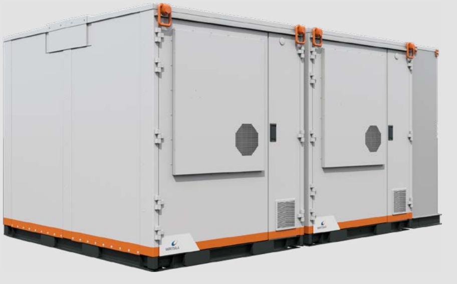
Figure 2: Enclosures can be combined to form a complete system, with up to eight enclosures linked together