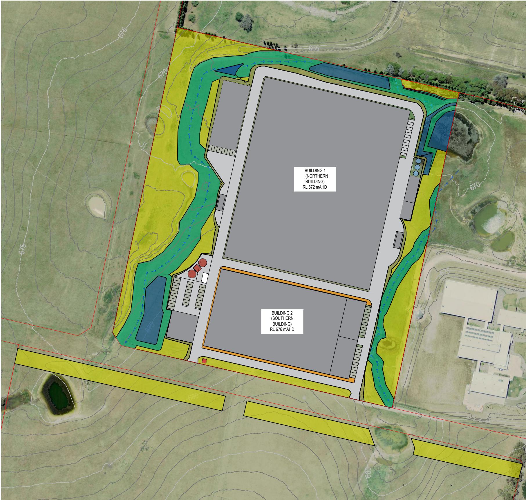
LANDSCAPE SITE PLAN SCALE 1:2000