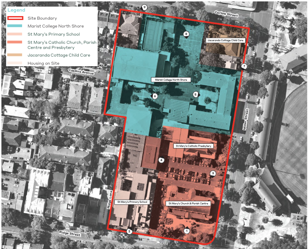
Figure 2 Site Aerial