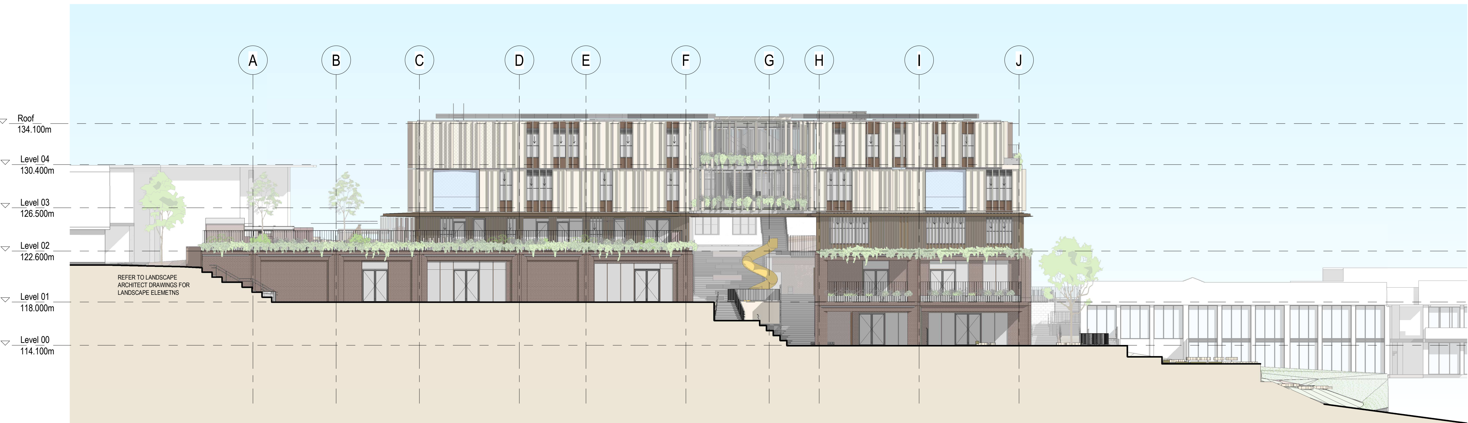
1 SOUTH ELEVATION 1 : 200