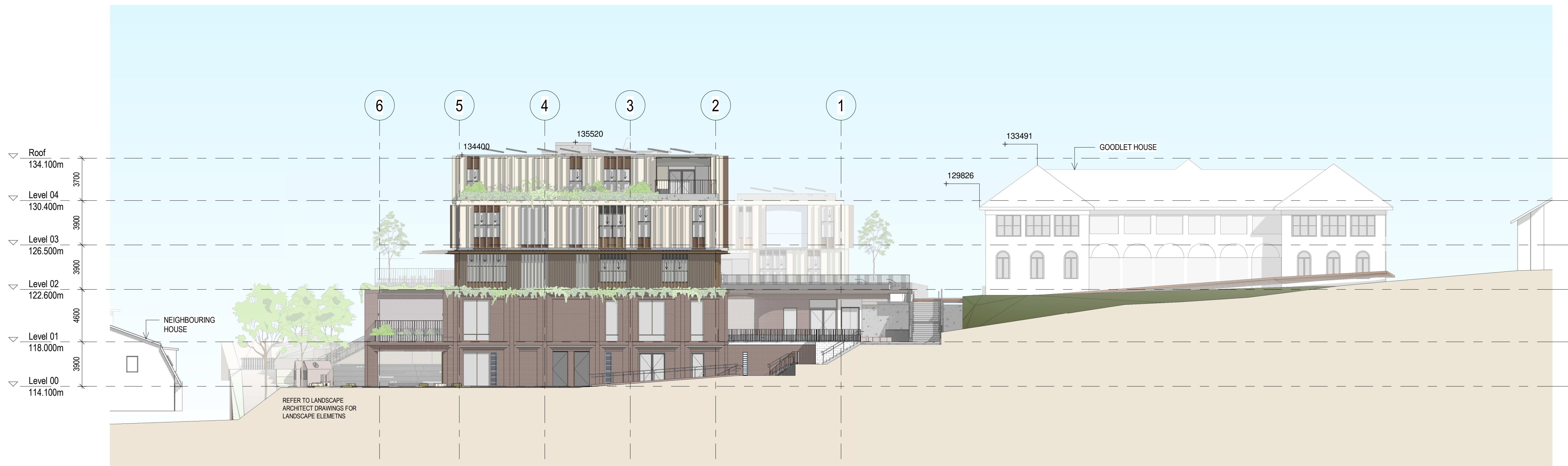
1 EAST ELEVATION 1 : 200