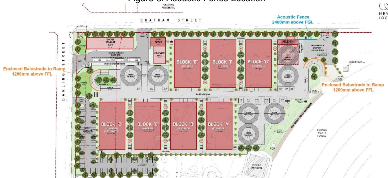
Figure 3: Acoustic Fence Location

4.13 Construction Certificate documentation must be forwarded to Reverb Acoustics to ensure all recommendations within this report have been incorporated into the design of the site.