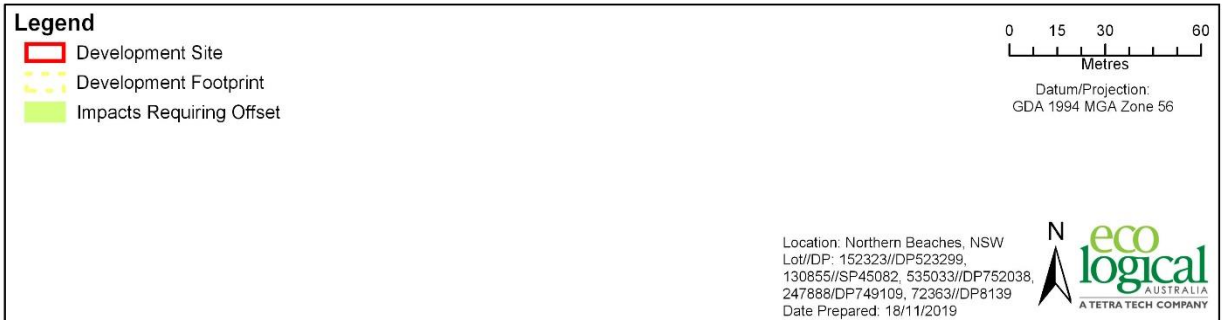
Figure 8: Impacts requiring offset