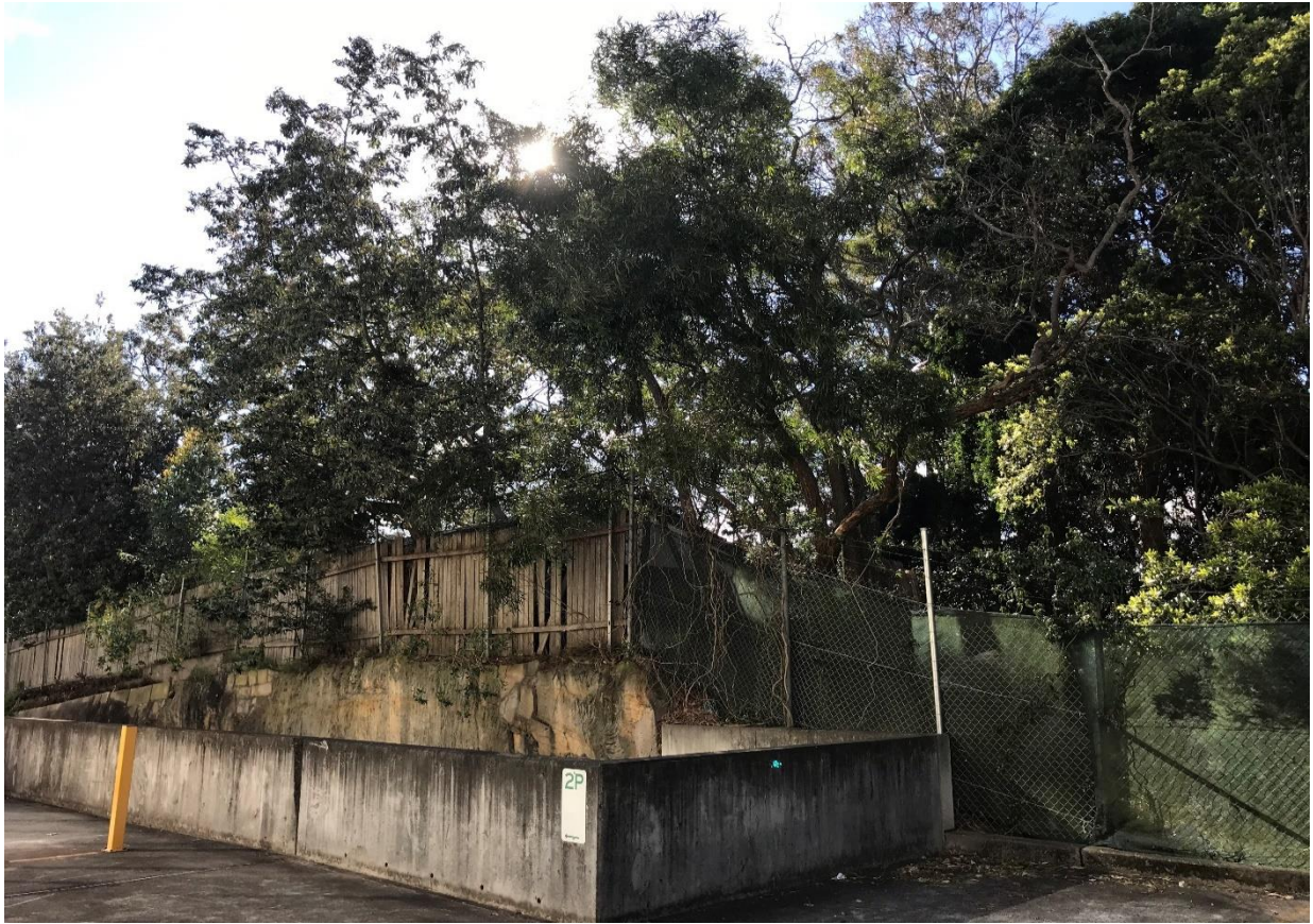
Photo 3: Overhanging PCT 1776 located within Stony Ranges Botanic Gardens to the north of the development area