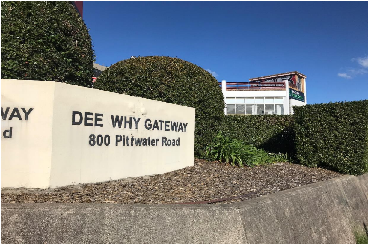
Photo 2: Example of planted exotic vegetation at frontage of 800 Pittwater Road, Dee Why